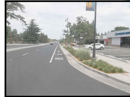
Established a Class II Bike Lane