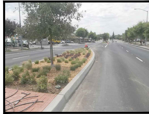
Replaced Dual Left Turn Lanes with Landscape Medians and Dedicated Left Turn Pockets