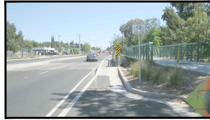
Added a Pedestrian Bridge