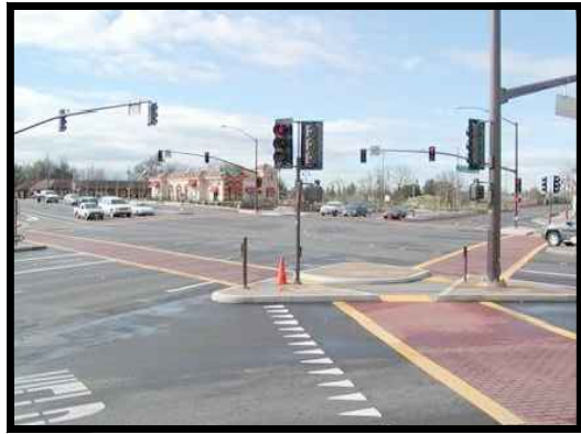
Added ADA Features