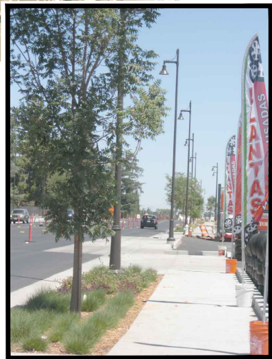
Installed Energy Efficient Decorative Street Lighting