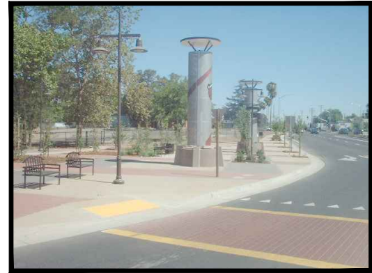
Sylvan Corners Architectural Elements