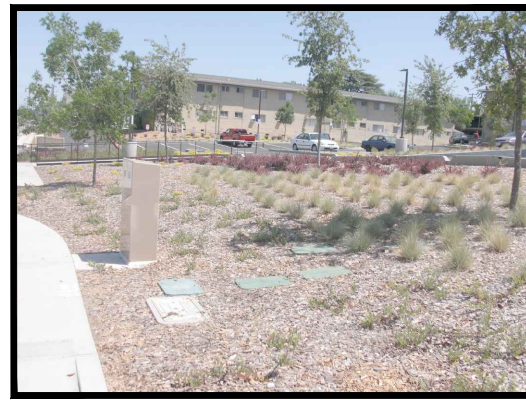
Planted a Total of 230 New Trees