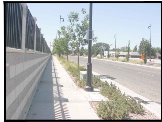
Created a Pedestrian/Vehicular Buffer