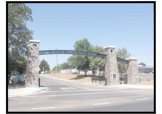
New Rusch Park Entrance