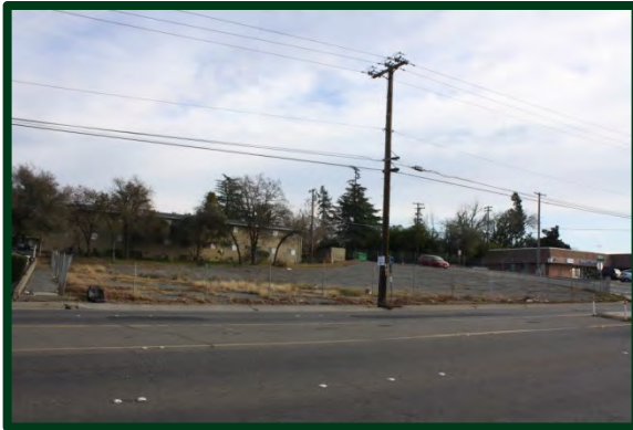
Before: Vacant, fenced lot