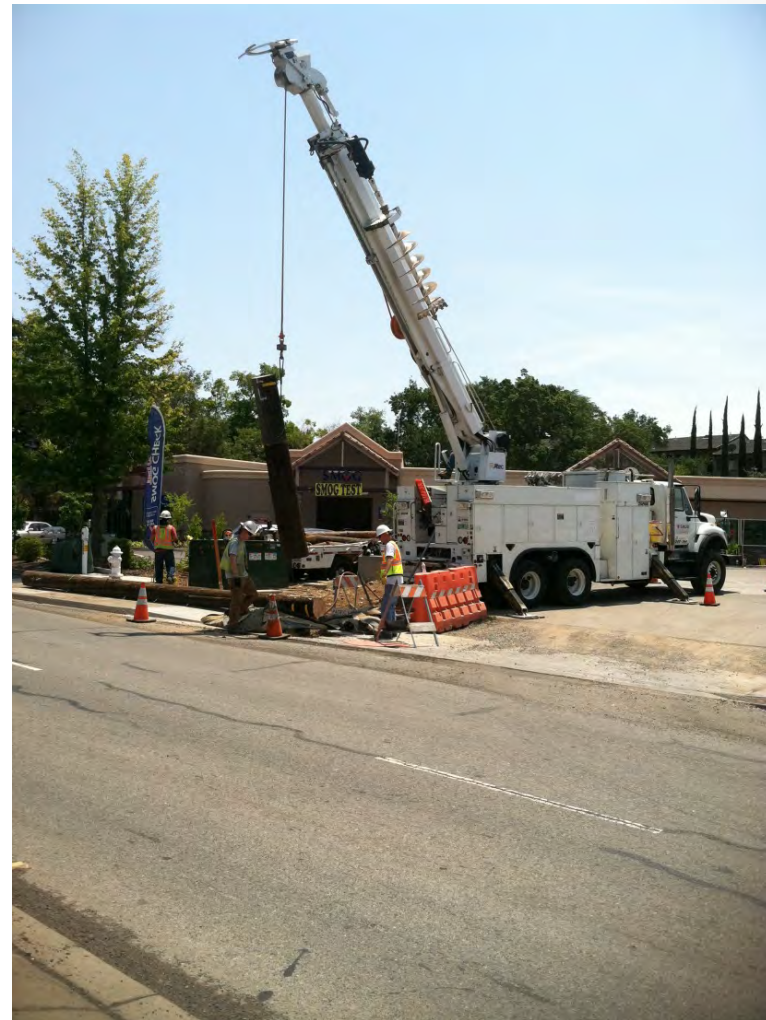
Utility Pole Removal at Valero Gas Station