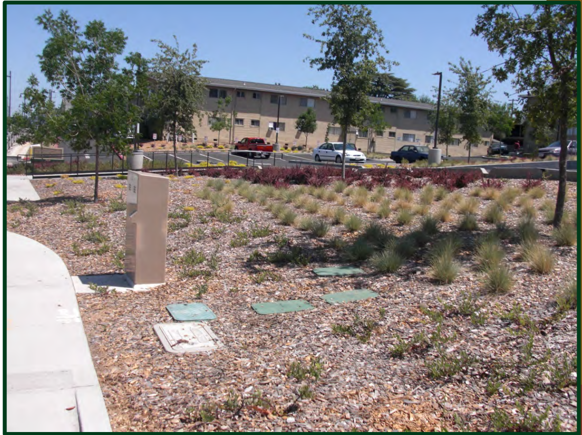
After: Parking lot for Sierra Oaks Apartments