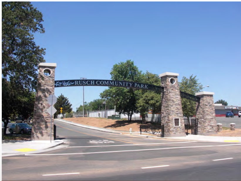
New entrance at Rusch Park