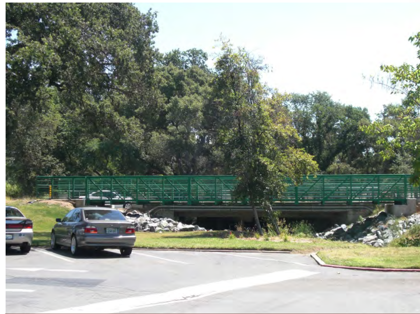
New pedestrian bridge at Rusch Park