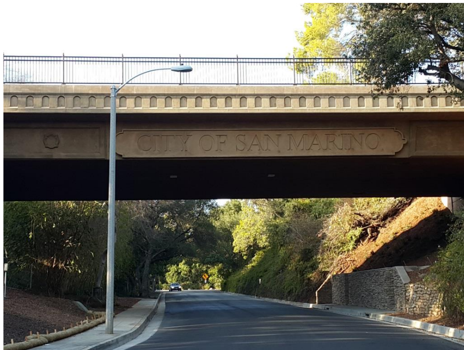
Figure 10: New Bridge Superstructure featuring decorative concrete bridge barrier railings & City of San Marino architectural detailing