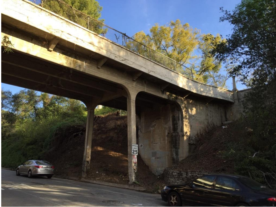
Figure 1: Original Bridge