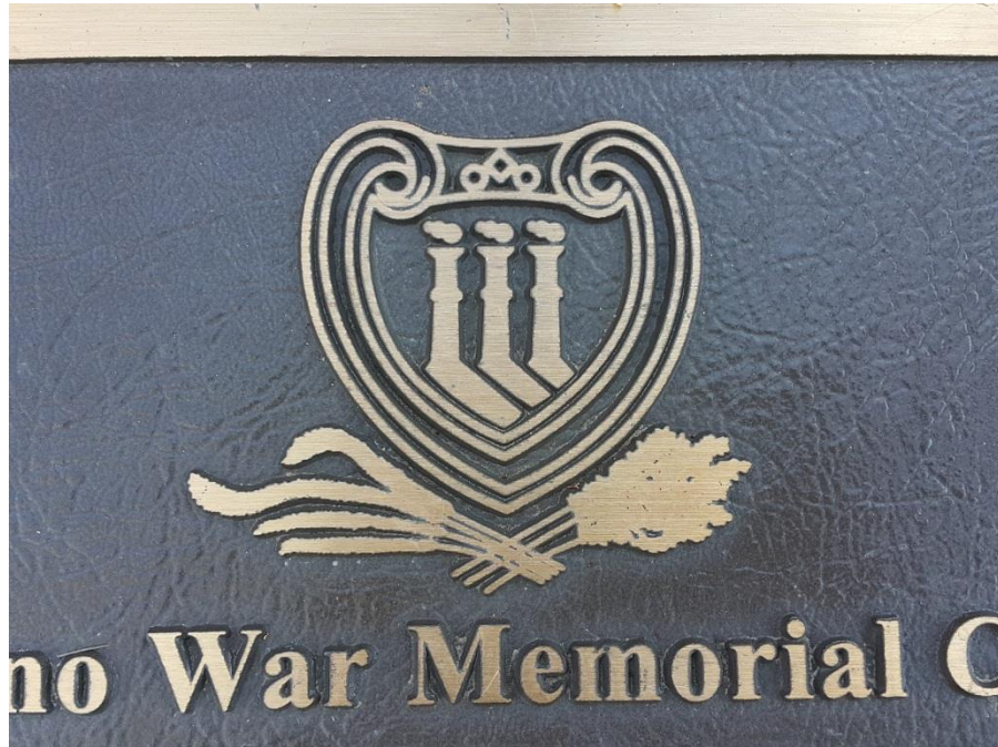
Figure 16: Veterans Memorial at Lacy Park City of San Marino Seal