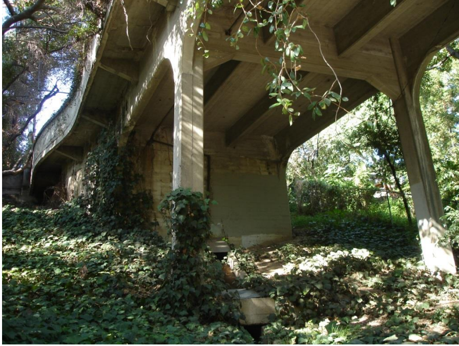
Figure 5: Original Bridge with vegetation along the West Abutment