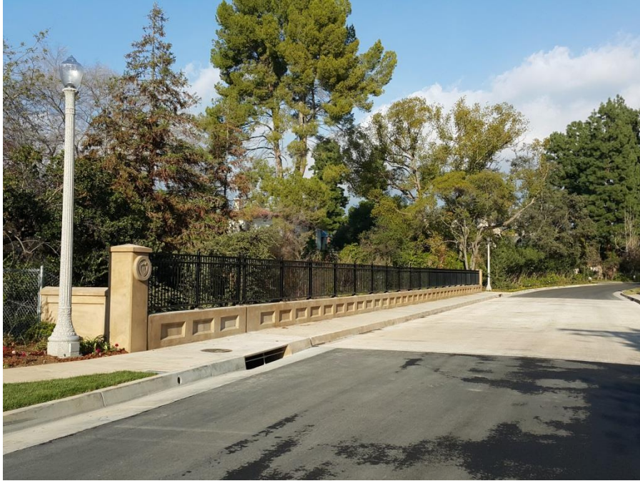
Figure 13: New Bridge Roadway detailing Vintage Streetlights, City Logo, and Decorative Pilaster