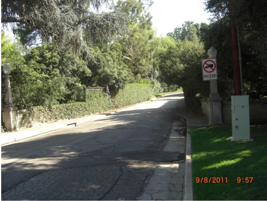
Figure 11: Original Bridge Roadway