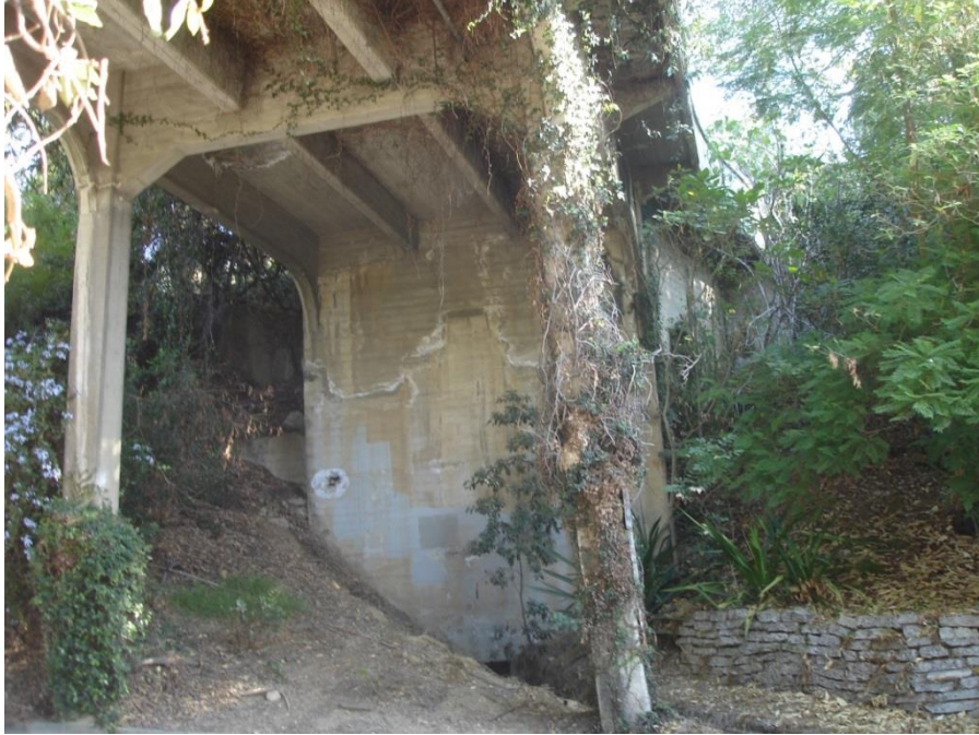
Figure 3: Original Bridge Substructure