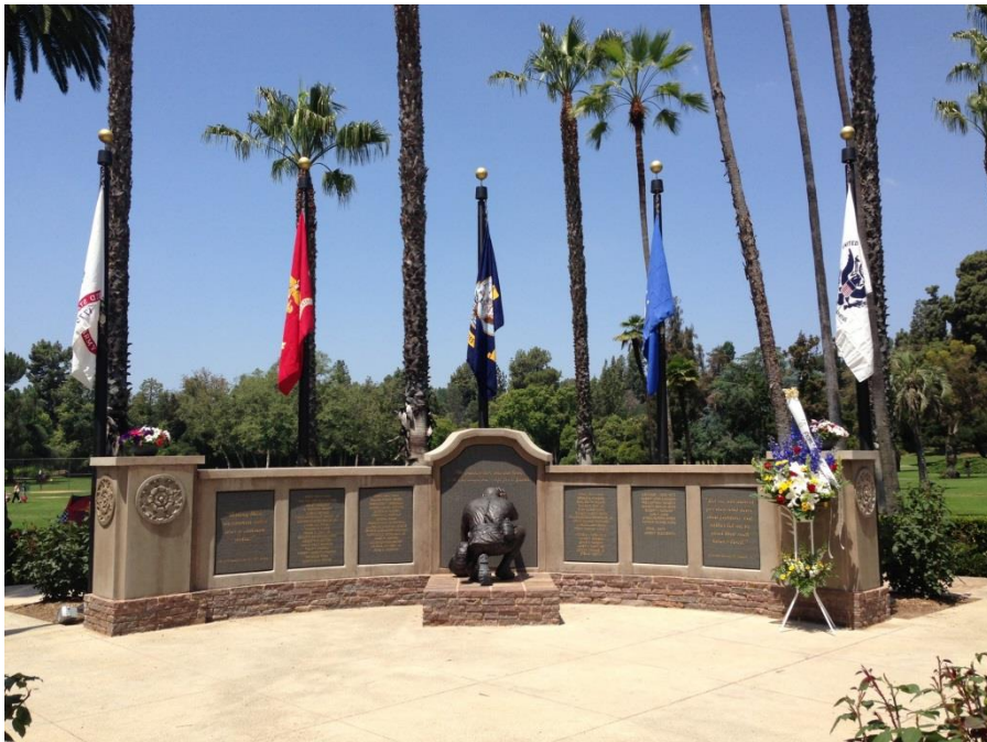
Figure 14: Veterans Memorial at Lacy Park in the City of San Marino