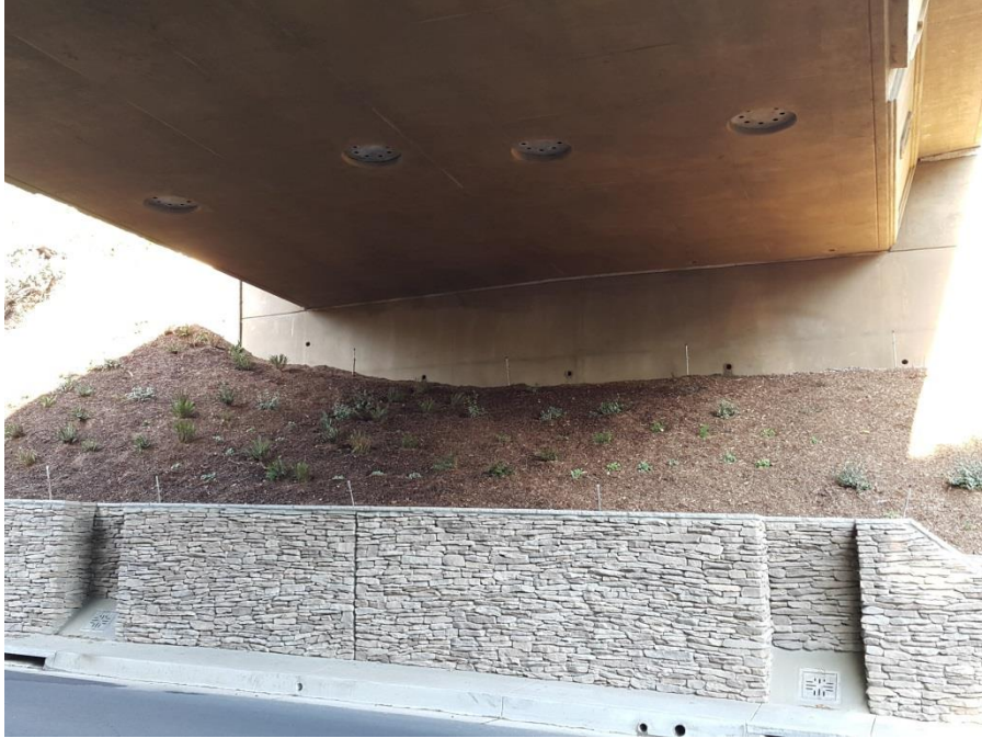
Figure 7: Drought Tolerant Plants & Drainage System along the East Abutment