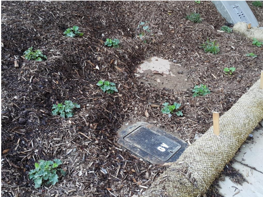
Figure 8: Drought Tolerant Plants