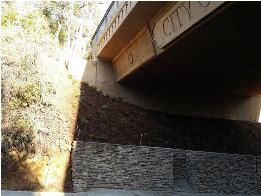
Figure 4: New Bridge Substructure detailing Drought Tolerant Plants