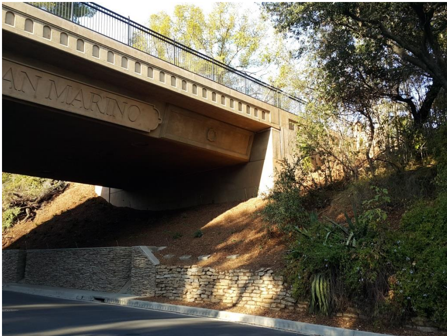
Figure 2: New Bridge detailing decorative concrete bridge barrier railings & City of San Marino architectural detailing