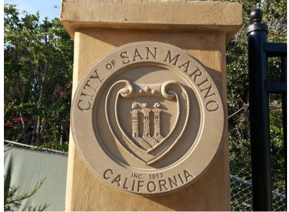
Figure 15: New Bridge with City of San Marino Seal