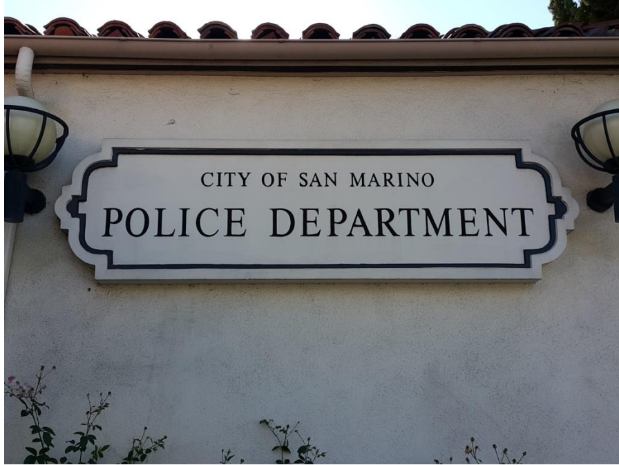
Figure 17: Lettering Detail at City of San Marino Police Department