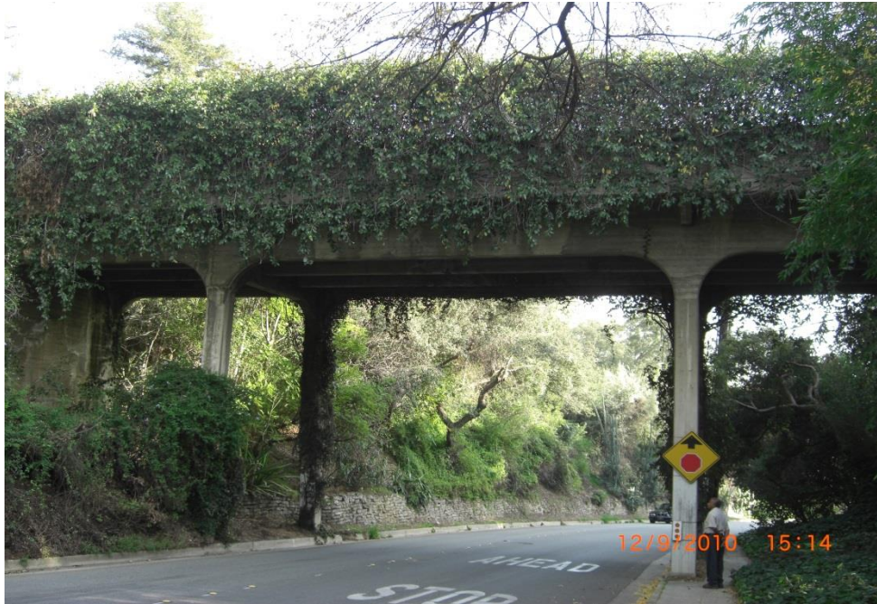
Figure 9: Original Bridge Superstructure