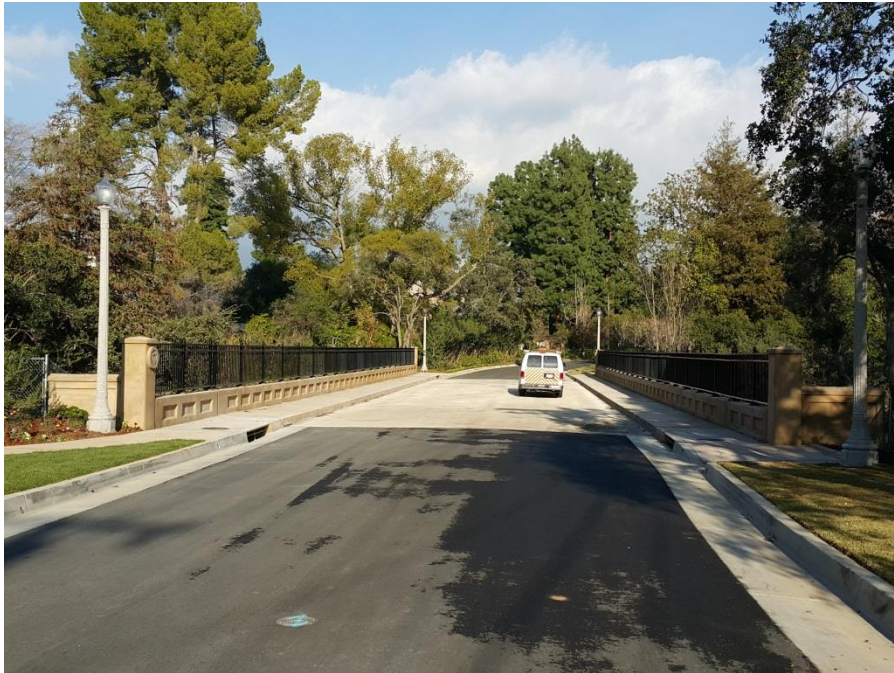
Figure 12: New Bridge Roadway