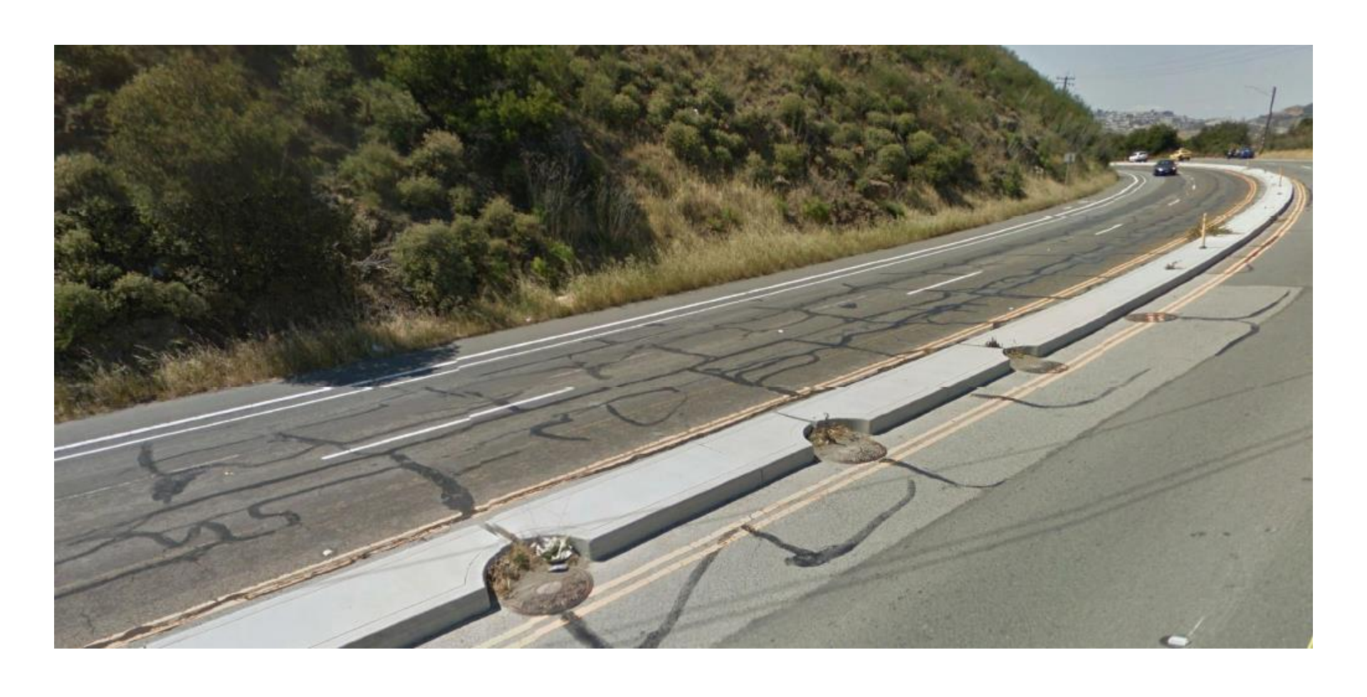
Bayshore Blvd before construction