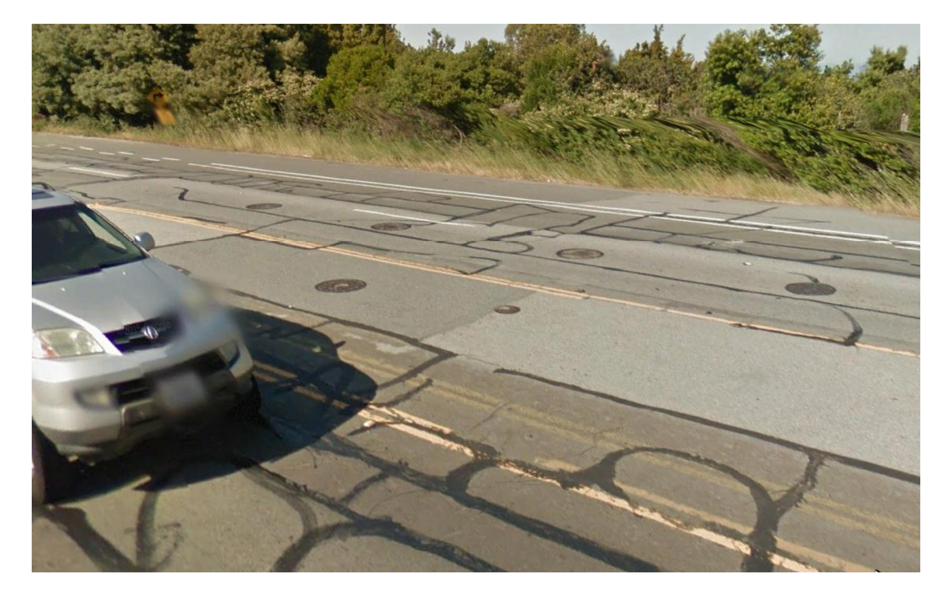
Bayshore Blvd before construction