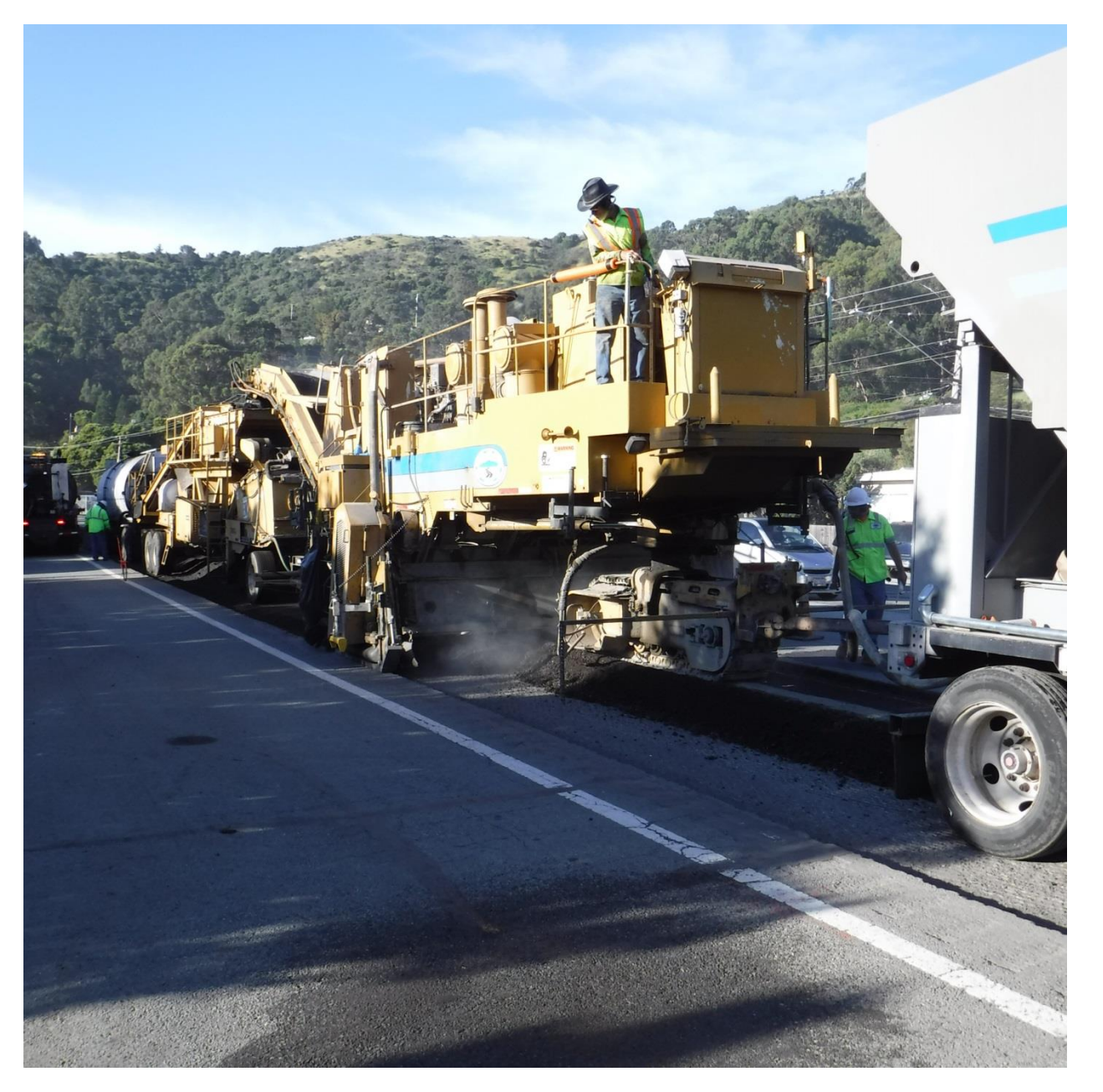
Cold-In-Place recycling train