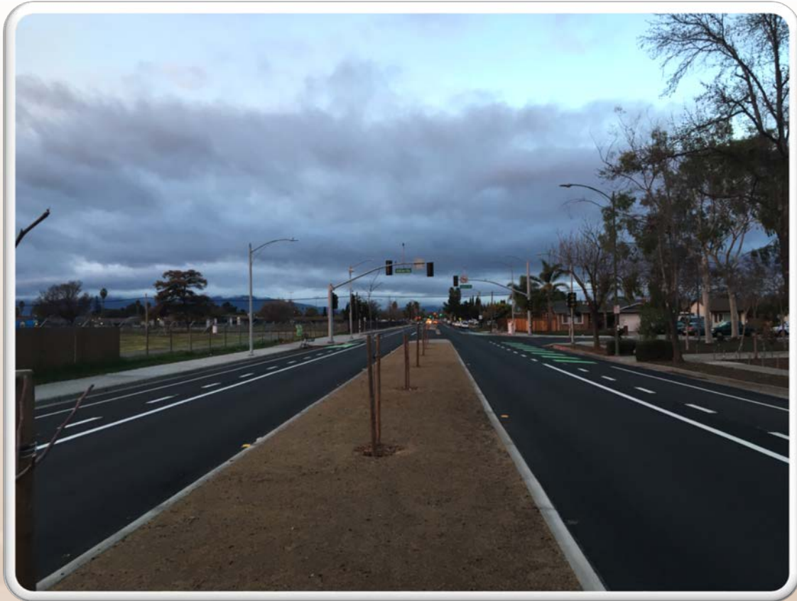
Ocala Avenue looking west towards Daytona Drive