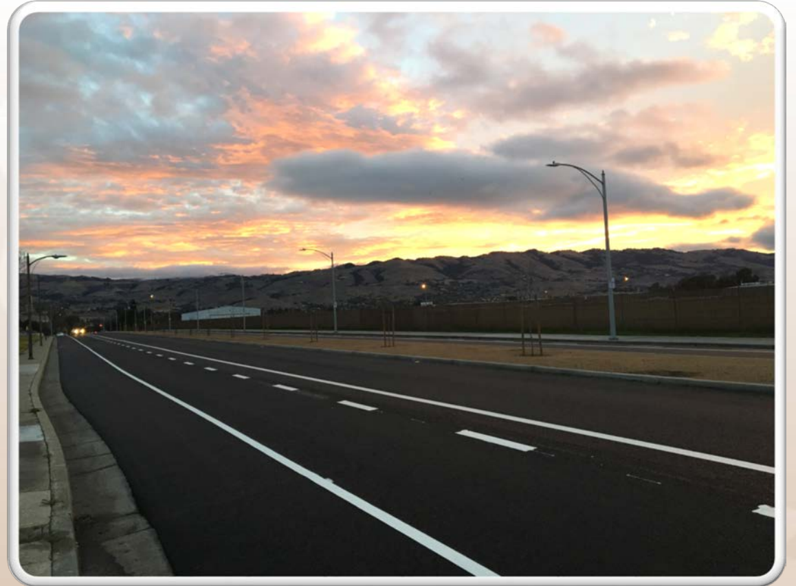
Ocala Avenue looking east towards Capitol Expressway