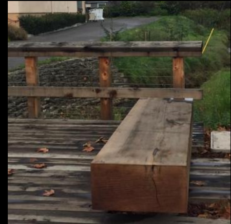
Reed creek overlook