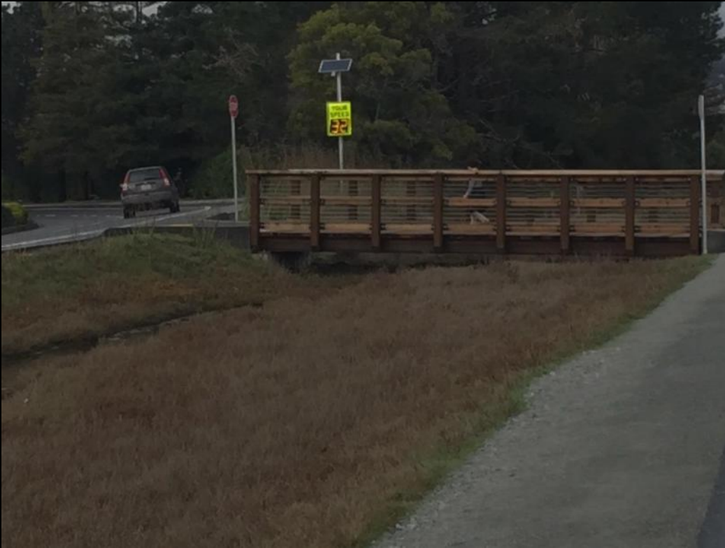
Bicycle / Pedestrian bridge connection to the Bay Trail