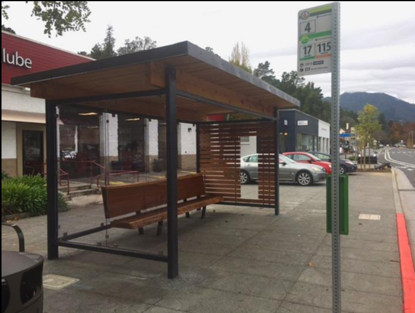
New Bus Shelter