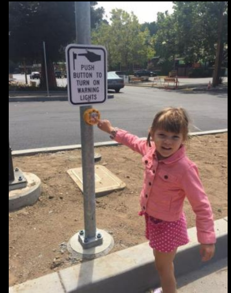
New Pedestrian Flashing Beacons