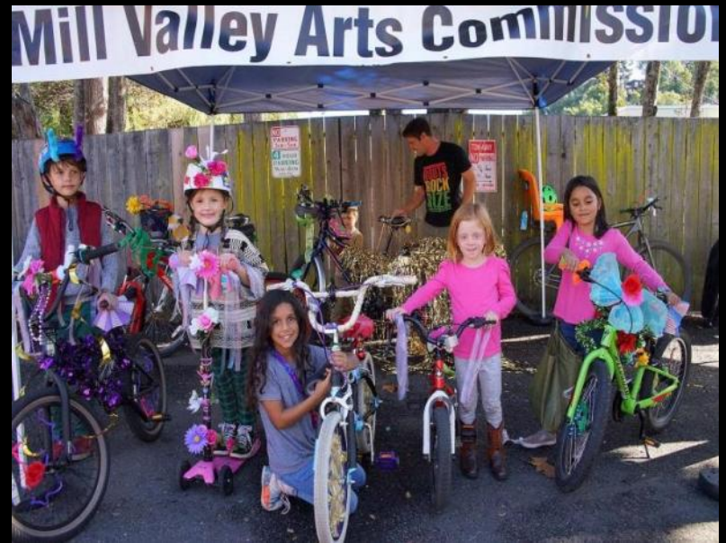
MillerFest Community Celebration