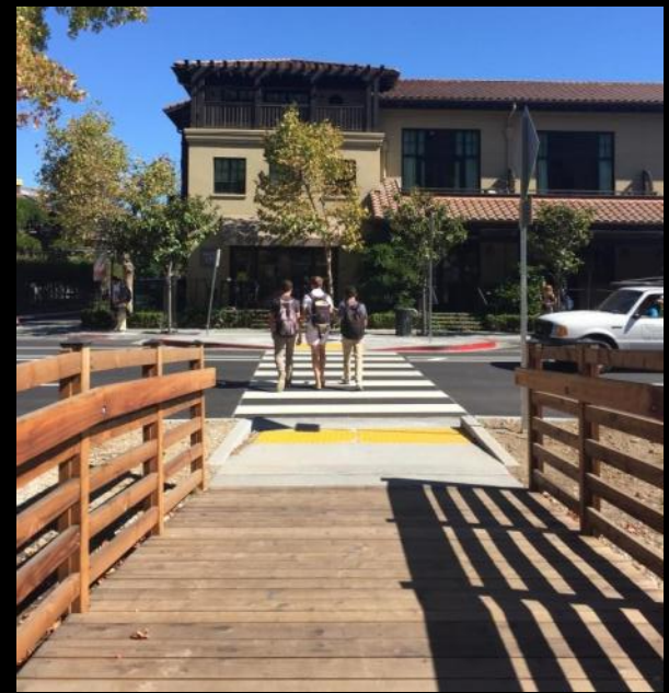
Bicycle & Pedestrian Safety Improvements