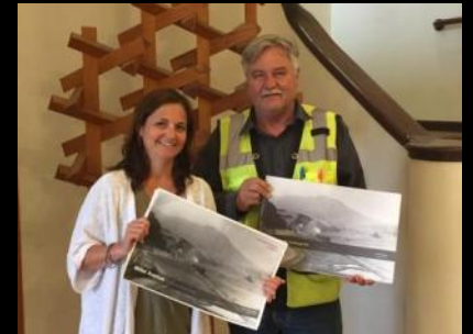
Miller Avenue Streetcape Project Team