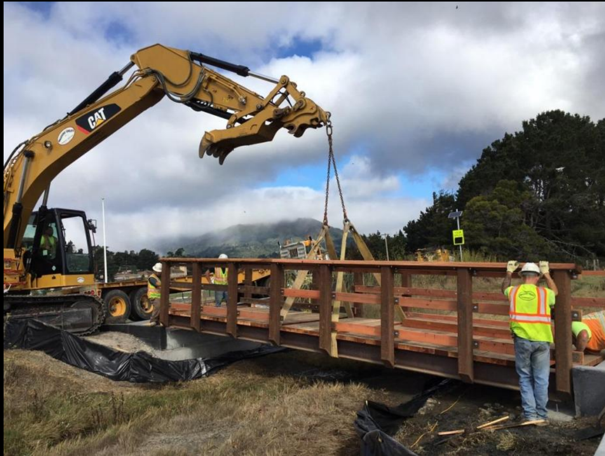
New Pedestrian Connection to Multi-Use Pathway/Bay Trail