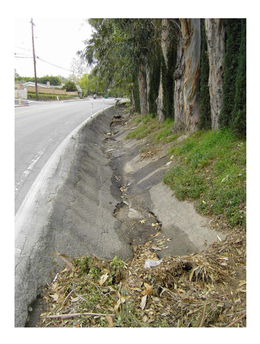
Pre-project condition with V-ditch