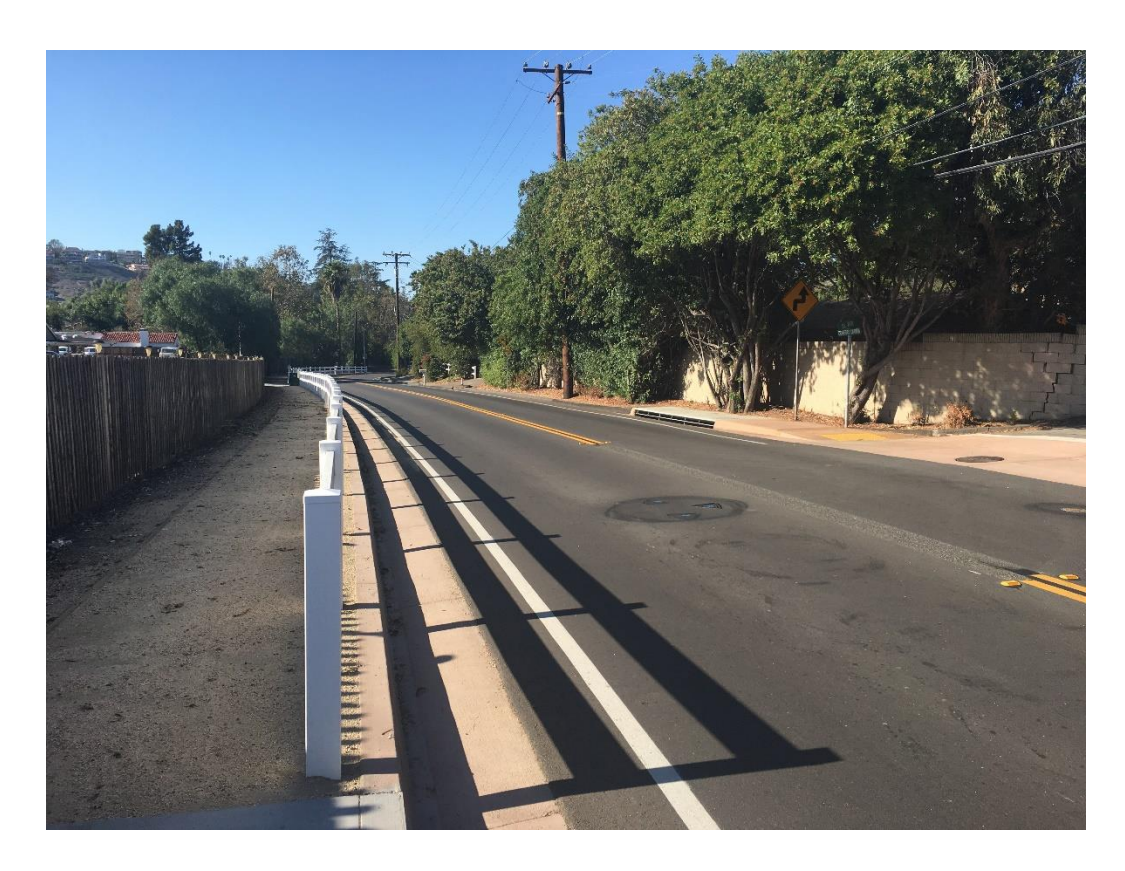
Project Completion – Roadway, Walking Path, Fencing