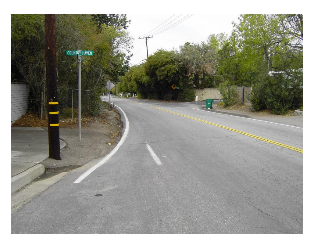
Pre-project condition with drainage ditch