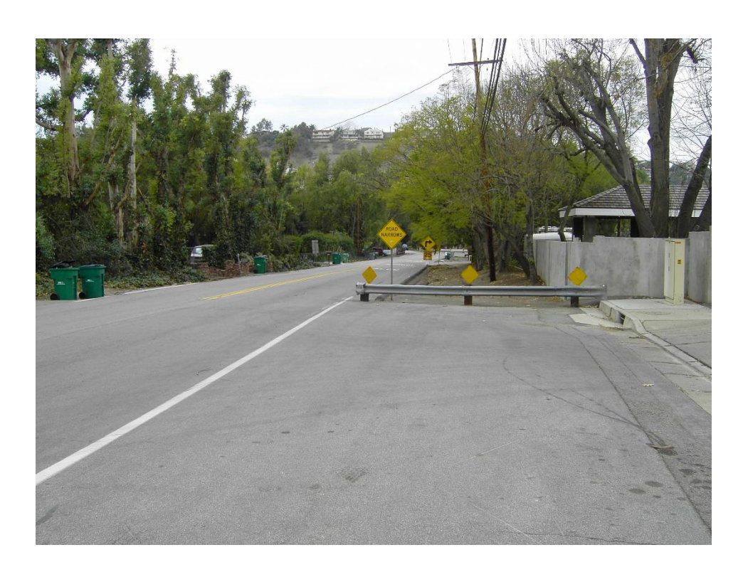
Pre-project condition with no safe route to school