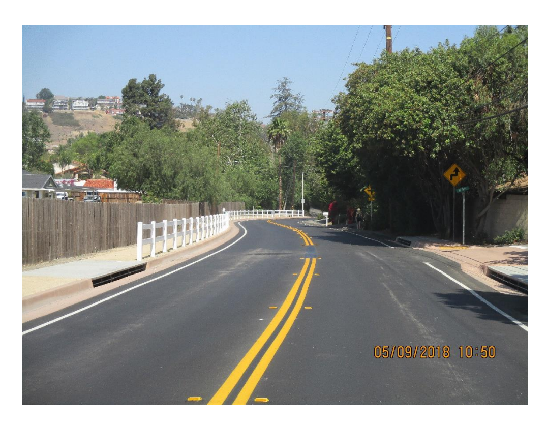
Project Completion – Roadway, Walking Path, Fencing, Storm Drain