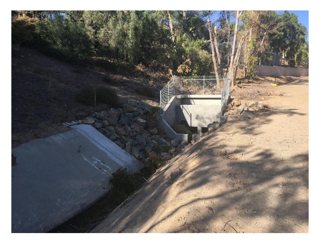
Project Completion – Weir Outlet structure