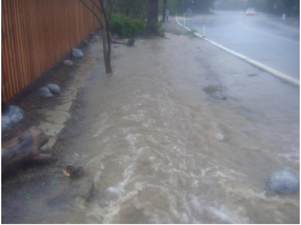
Pre-project flooding events