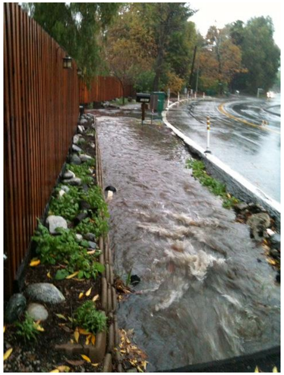
Pre-project flooding events