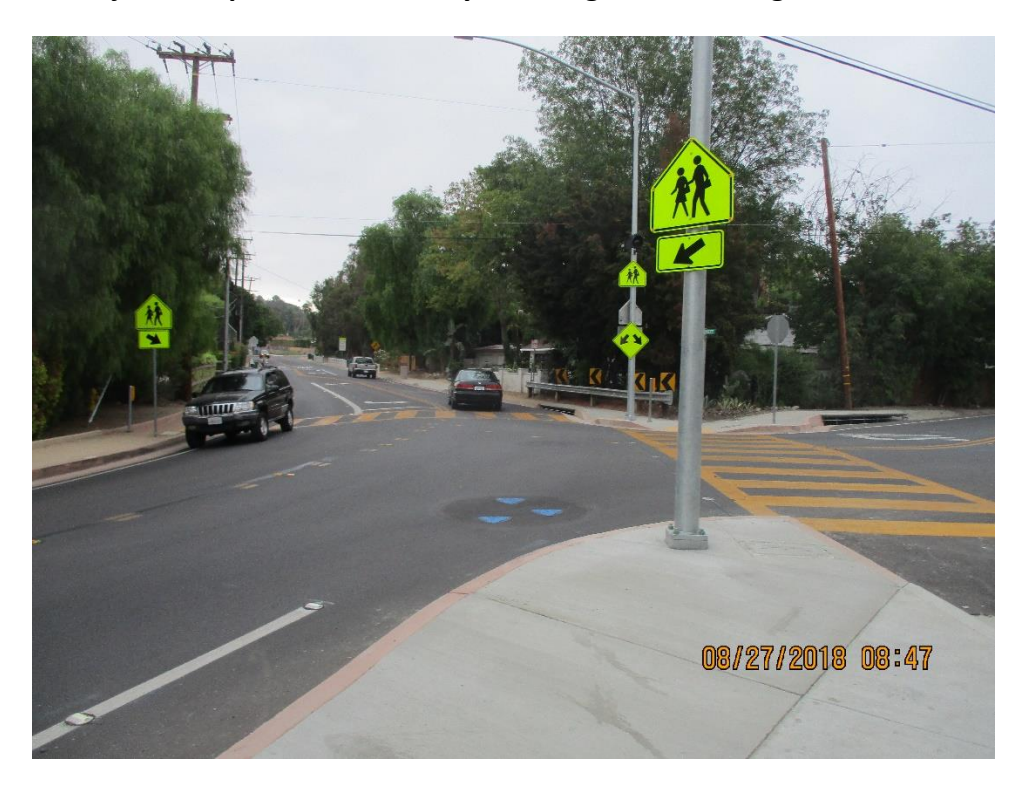
Project Completion - Barrett Lane/Crawford Canyon Intersection