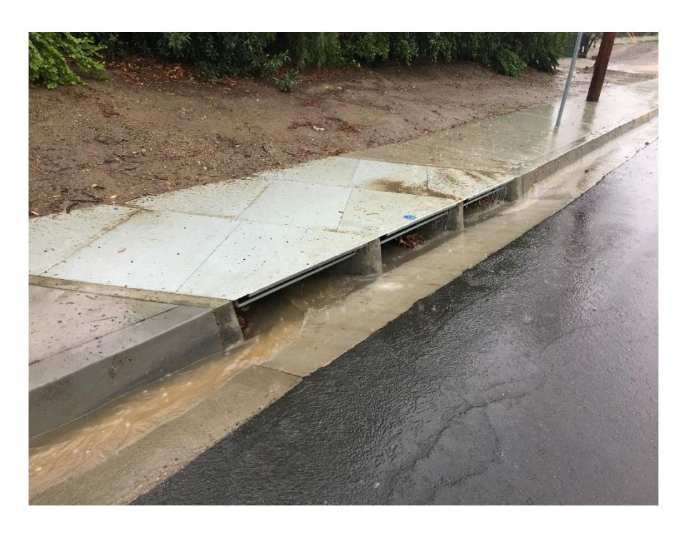
Project Completion – Newly Functioning Custom Catch Basin during storm event