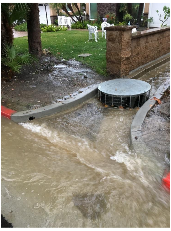
Project Completion – Newly Functioning Inlet during storm event