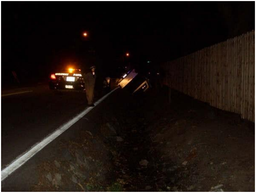
Pre-project Accidents in ditches