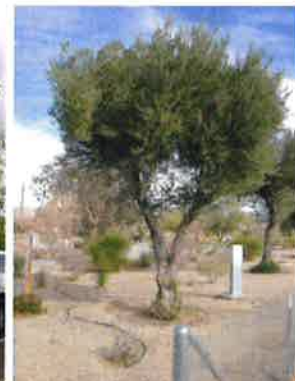
OLEA EUROPEA 'SWAN HILL'