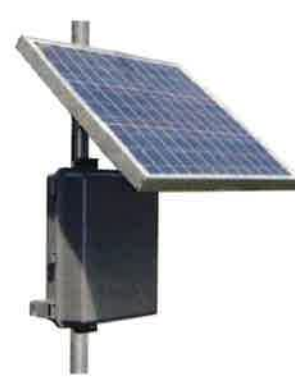
SOLAR PANEL AND BATTERY