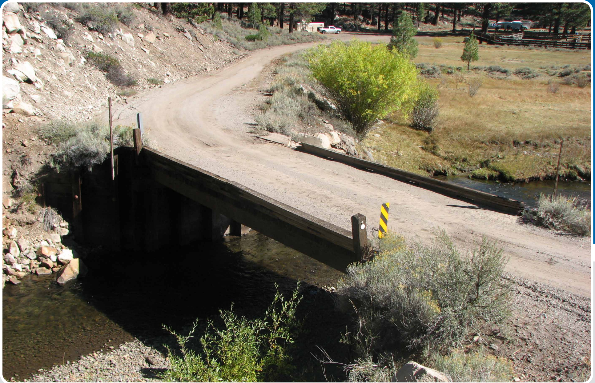
Original Bridge: Single-Span Timber Bridge DIXON MINE ROAD BRIDGE OVER WOLF CREEK, ALPINE COUNTY, CA