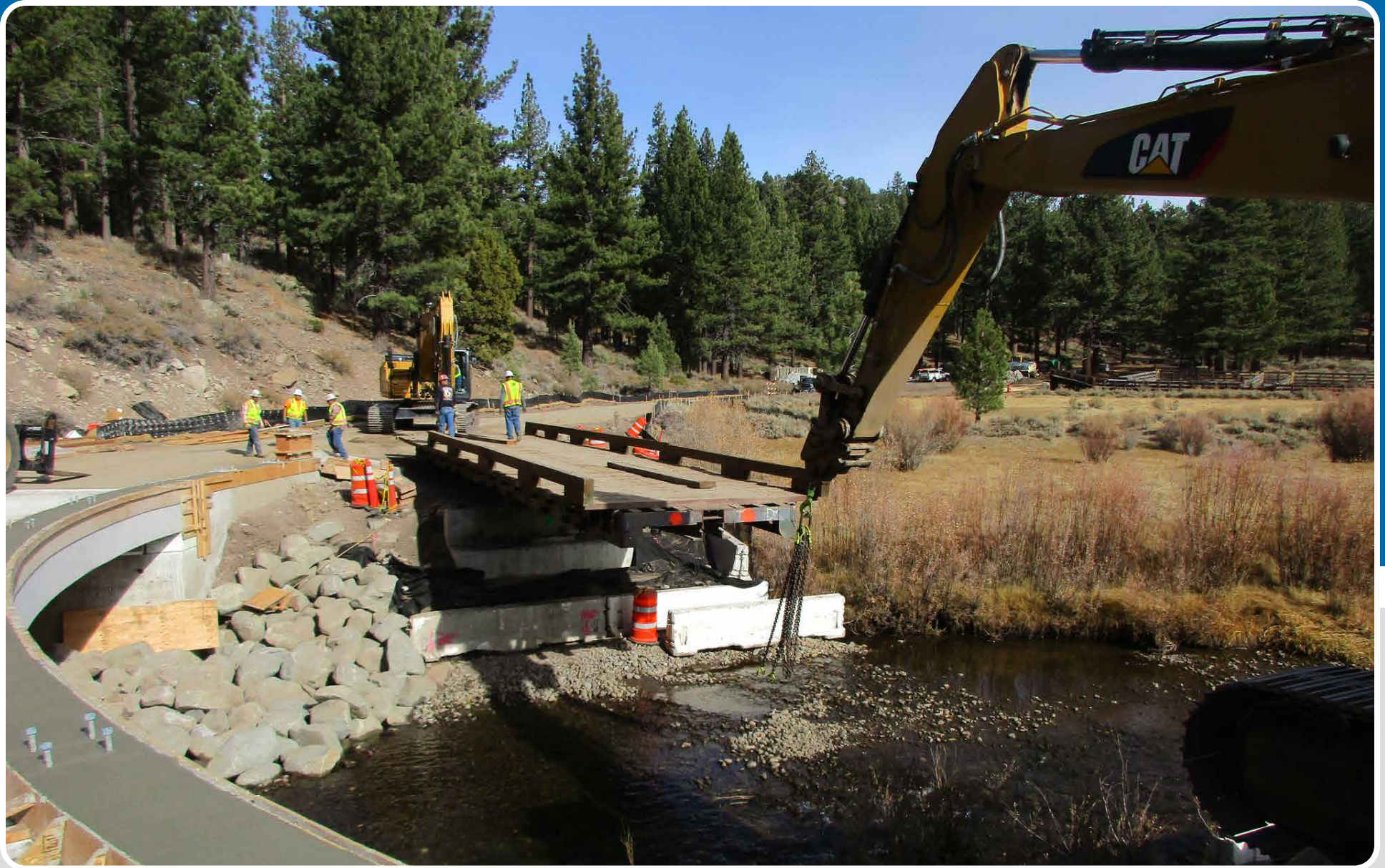
Removing Temporary Bridge DIXON MINE ROAD BRIDGE OVER WOLF CREEK, ALPINE COUNTY, CA