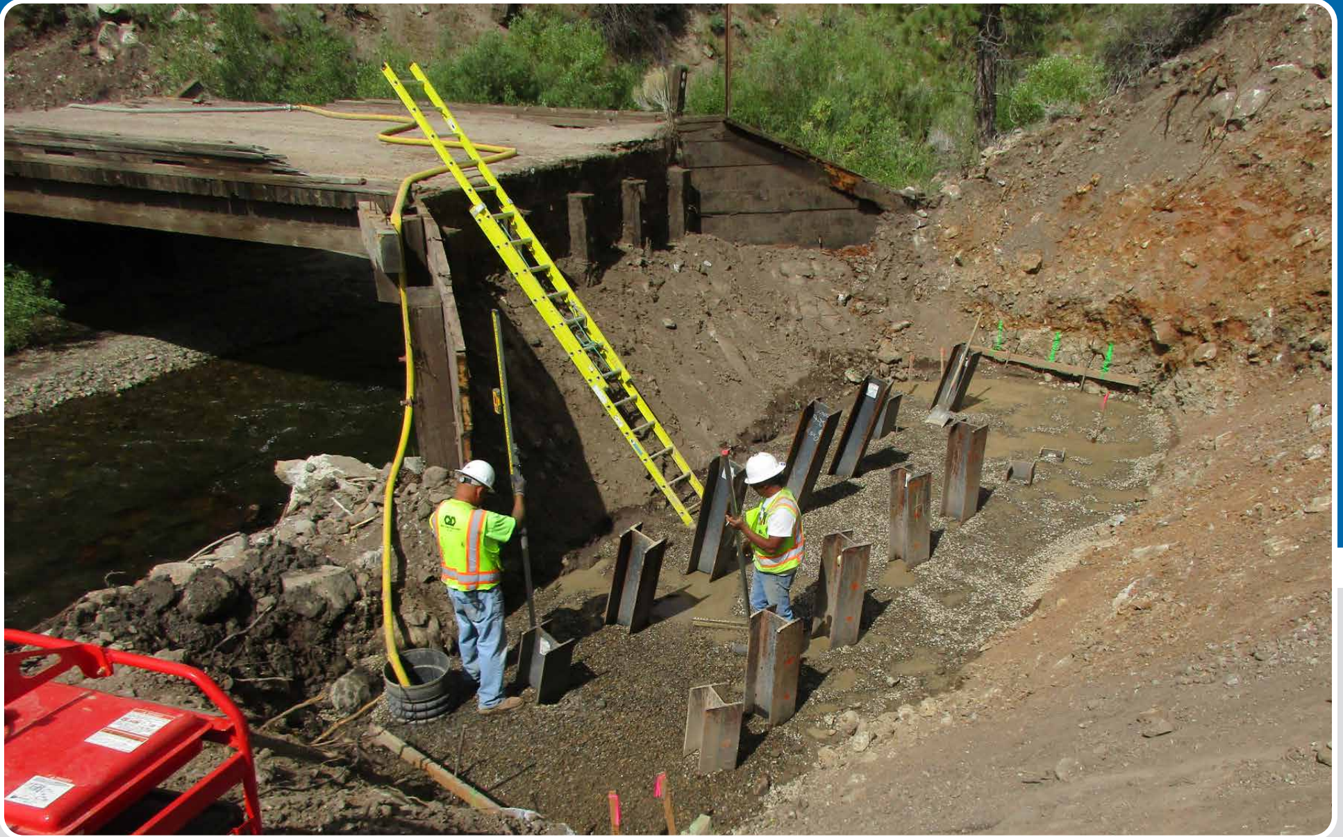
Driving Piles for New Abutment DIXON MINE ROAD BRIDGE OVER WOLF CREEK, ALPINE COUNTY, CA