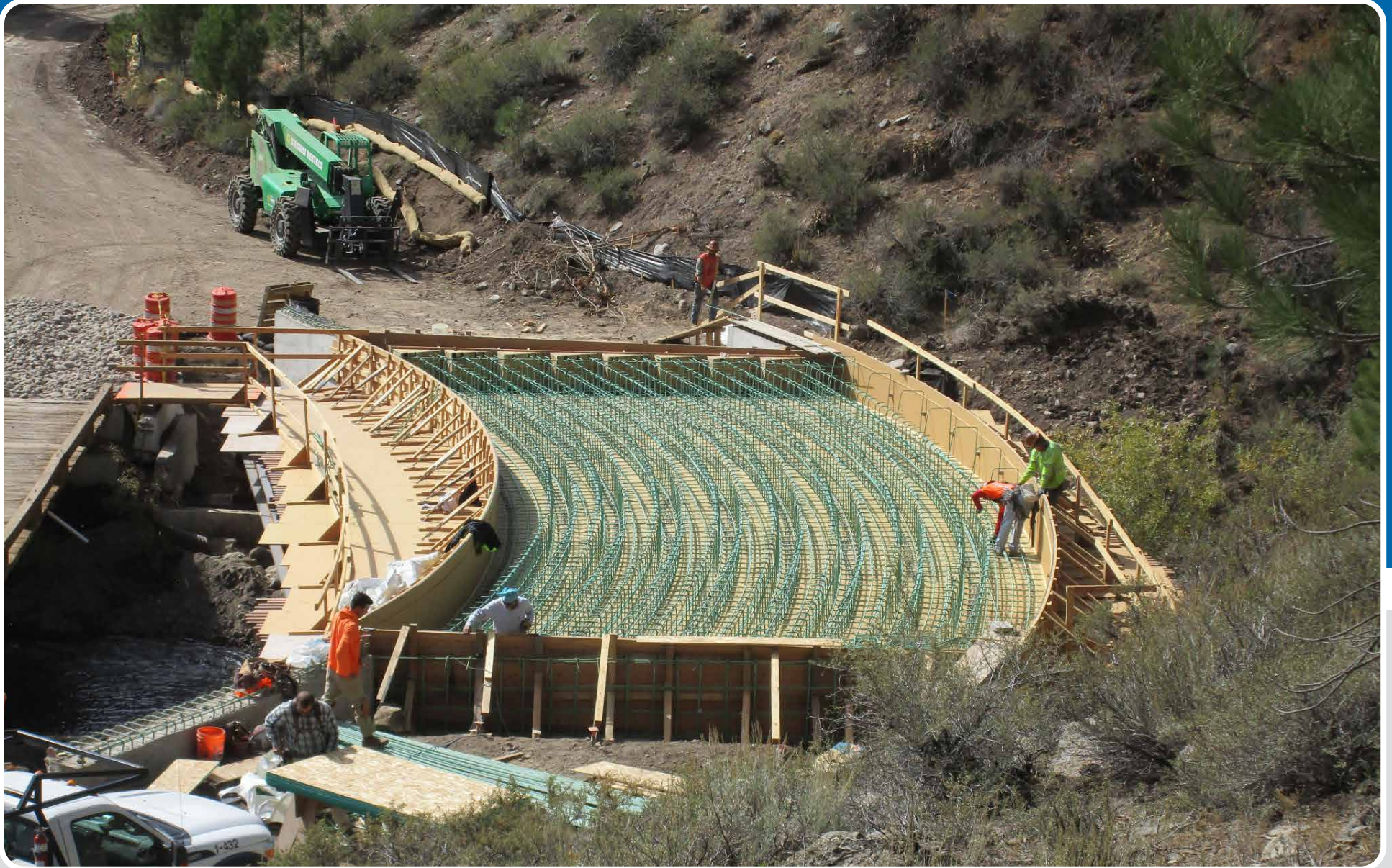
Placing Epoxy Coated Reinforcement DIXON MINE ROAD BRIDGE OVER WOLF CREEK, ALPINE COUNTY, CA