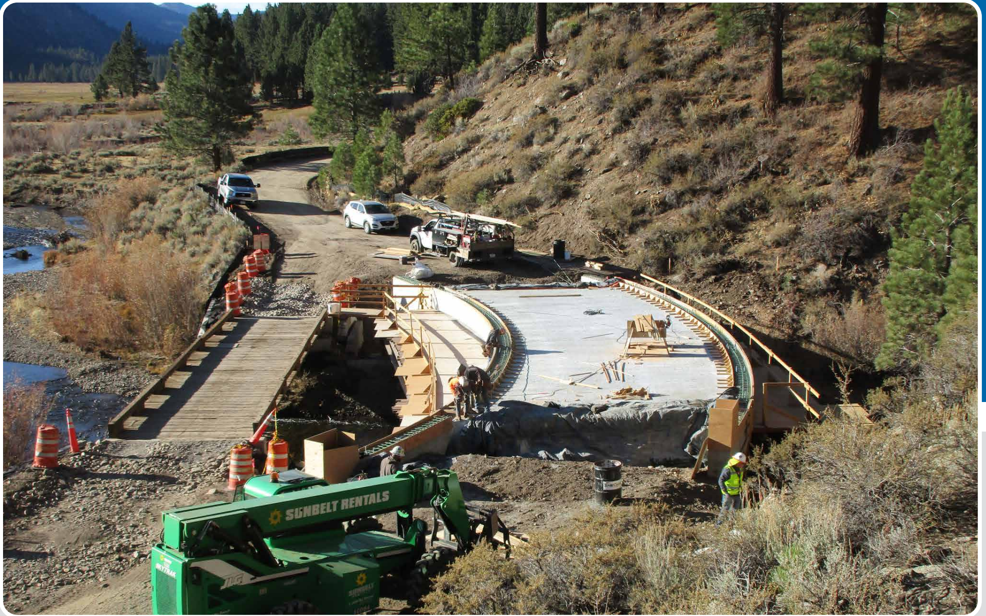
Post Deck Pour DIXON MINE ROAD BRIDGE OVER WOLF CREEK, ALPINE COUNTY, CA