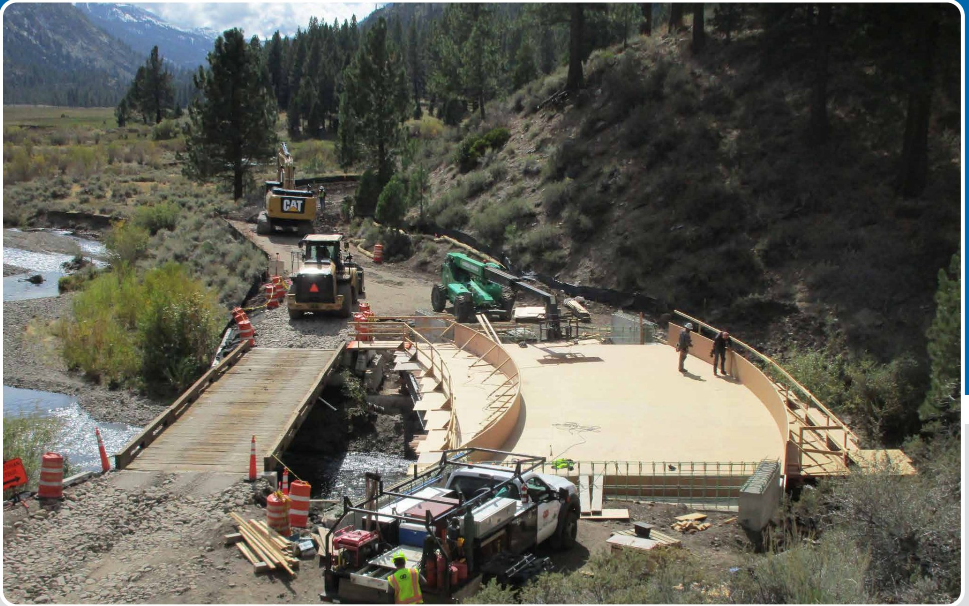
New Bridge Formwork DIXON MINE ROAD BRIDGE OVER WOLF CREEK, ALPINE COUNTY, CA