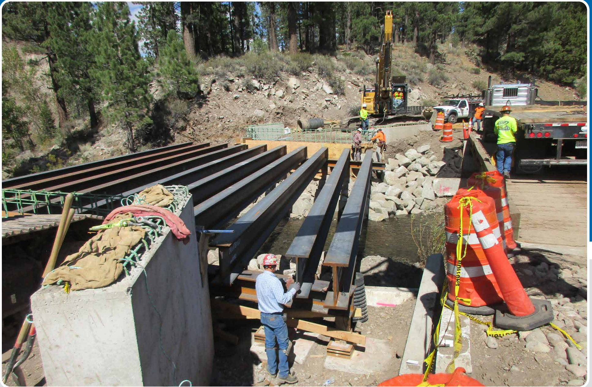
Single-Span Falsework DIXON MINE ROAD BRIDGE OVER WOLF CREEK, ALPINE COUNTY, CA