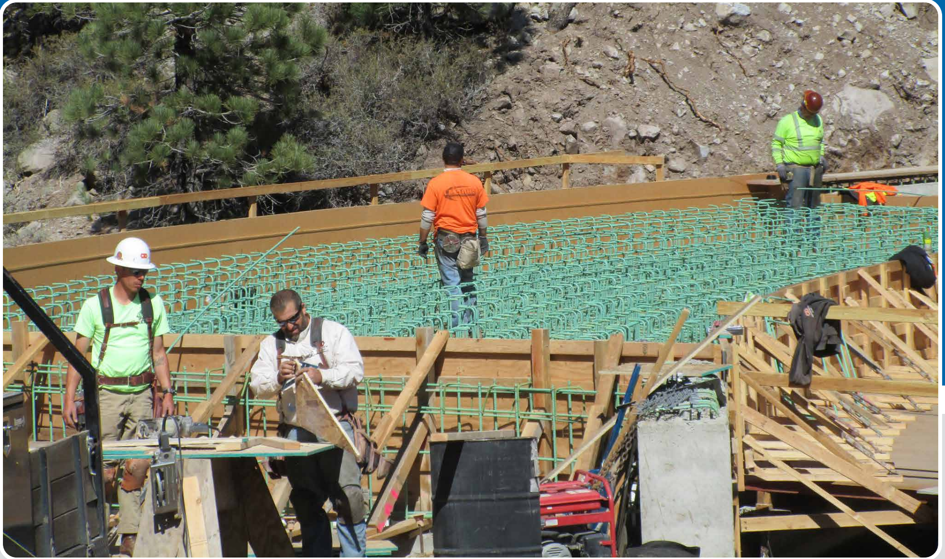
Placing Epoxy Coated Reinforcement DIXON MINE ROAD BRIDGE OVER WOLF CREEK, ALPINE COUNTY, CA