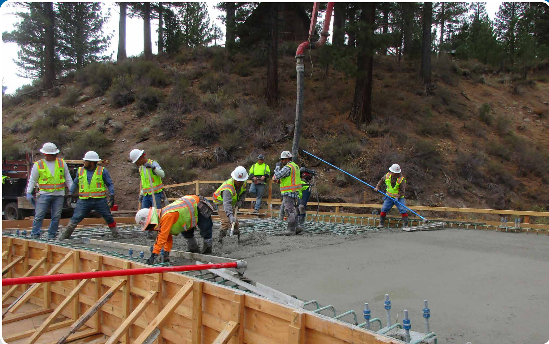
Deck Pour Day DIXON MINE ROAD BRIDGE OVER WOLF CREEK, ALPINE COUNTY, CA