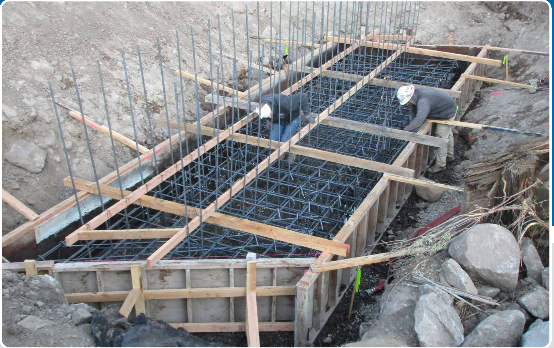
New Abutment Footing DIXON MINE ROAD BRIDGE OVER WOLF CREEK, ALPINE COUNTY, CA