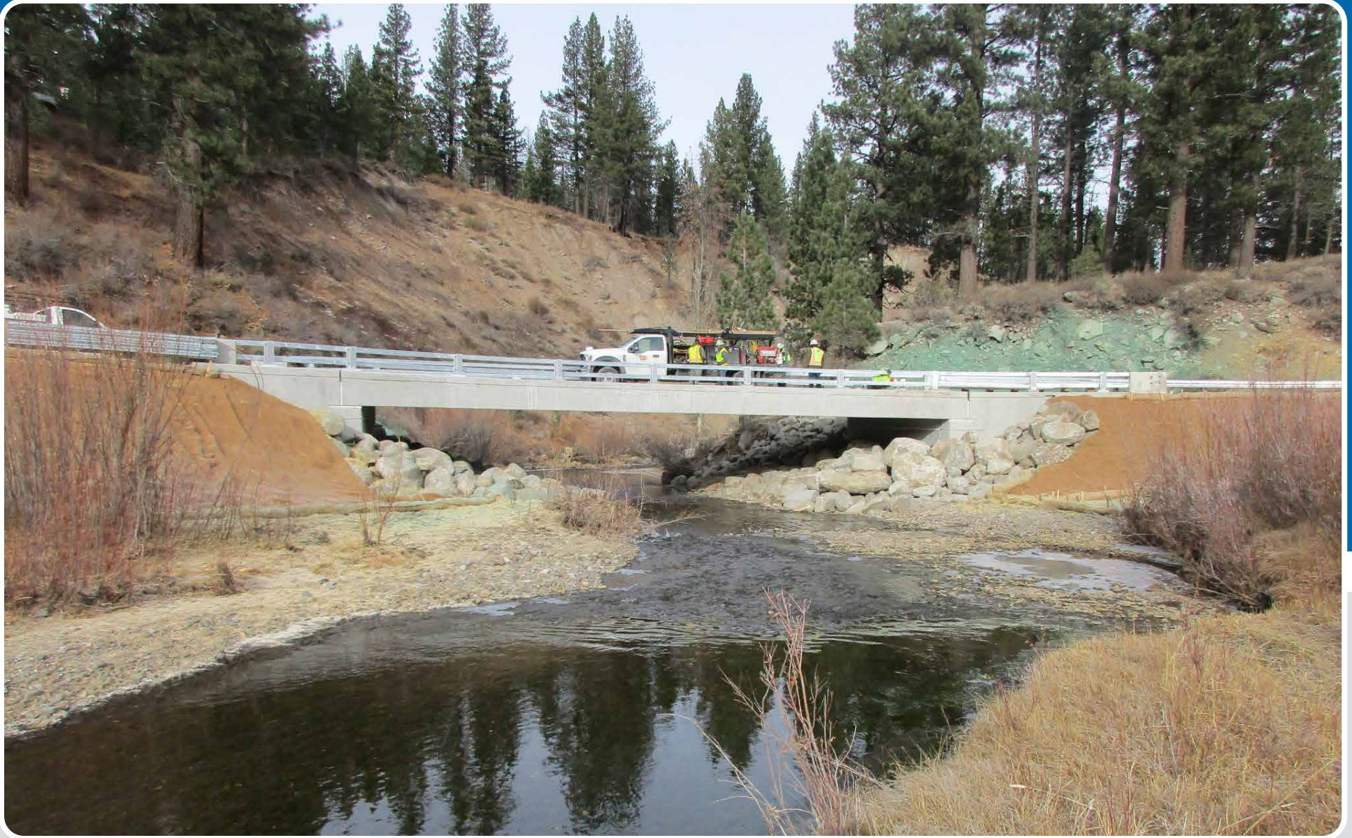
Completed Bridge Open for Traffic DIXON MINE ROAD BRIDGE OVER WOLF CREEK, ALPINE COUNTY, CA