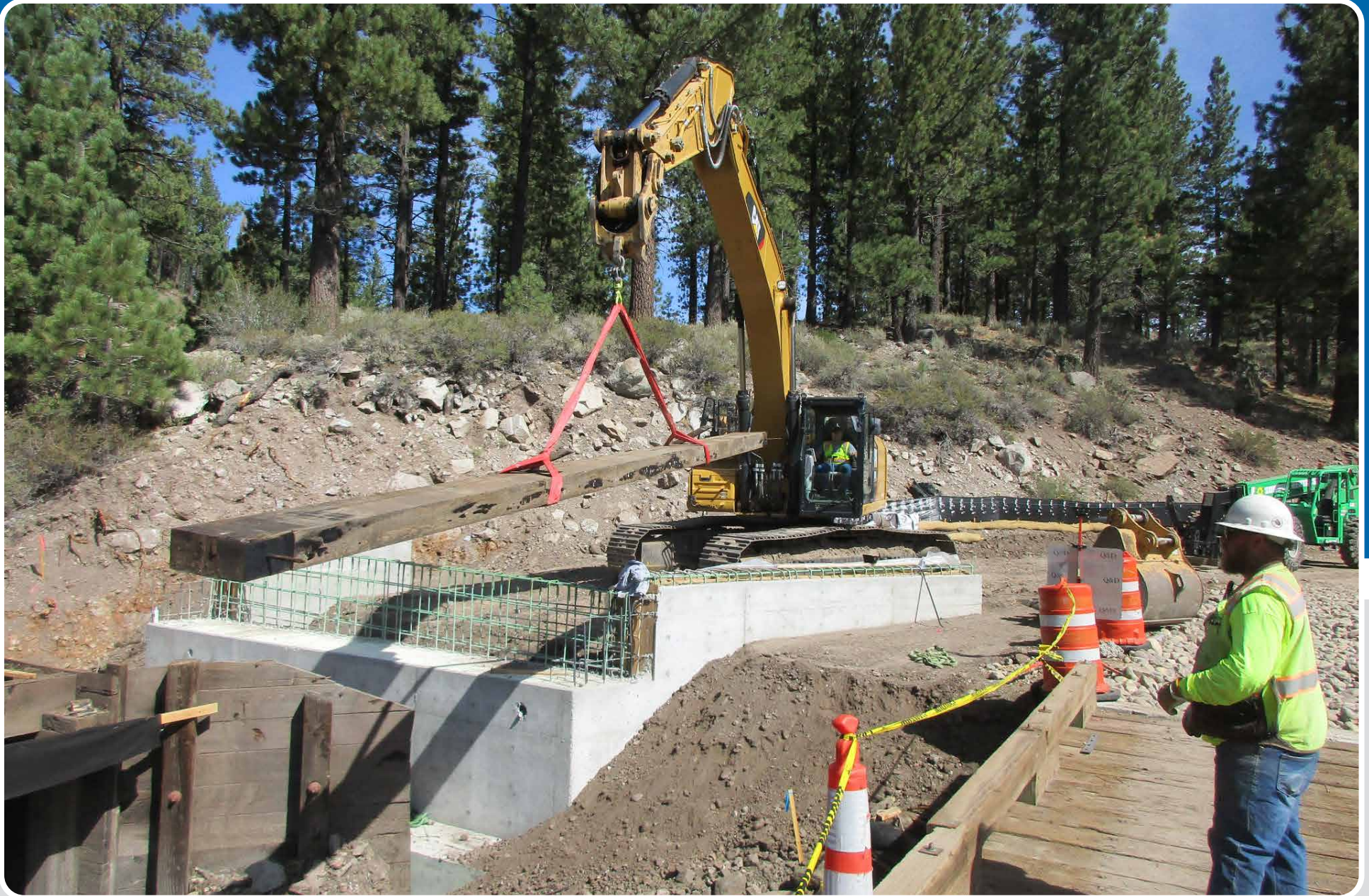
Dismantling the Old Timber Bridge DIXON MINE ROAD BRIDGE OVER WOLF CREEK, ALPINE COUNTY, CA