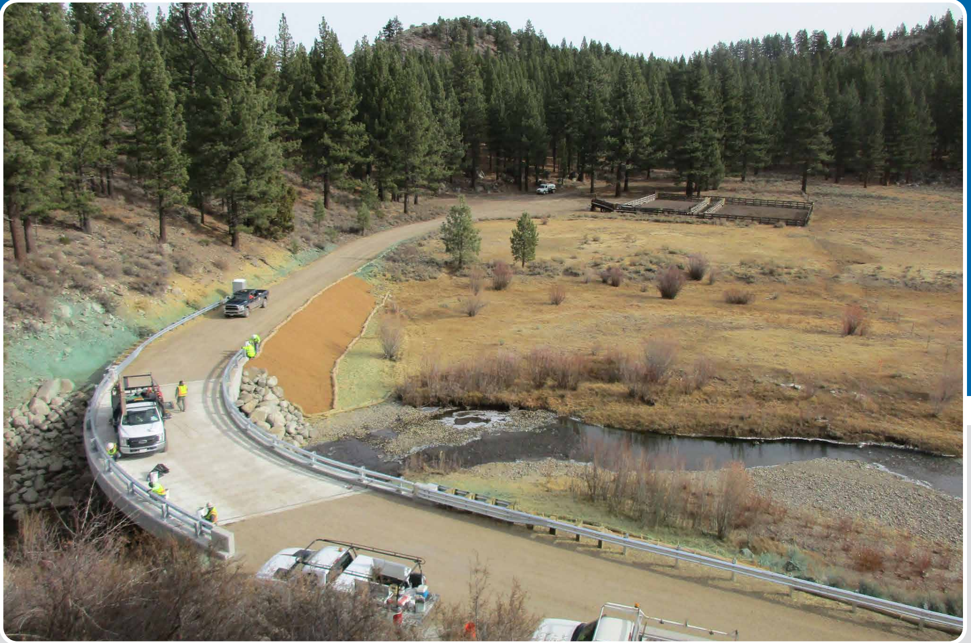
Completed Bridge Open for Traffic DIXON MINE ROAD BRIDGE OVER WOLF CREEK, ALPINE COUNTY, CA