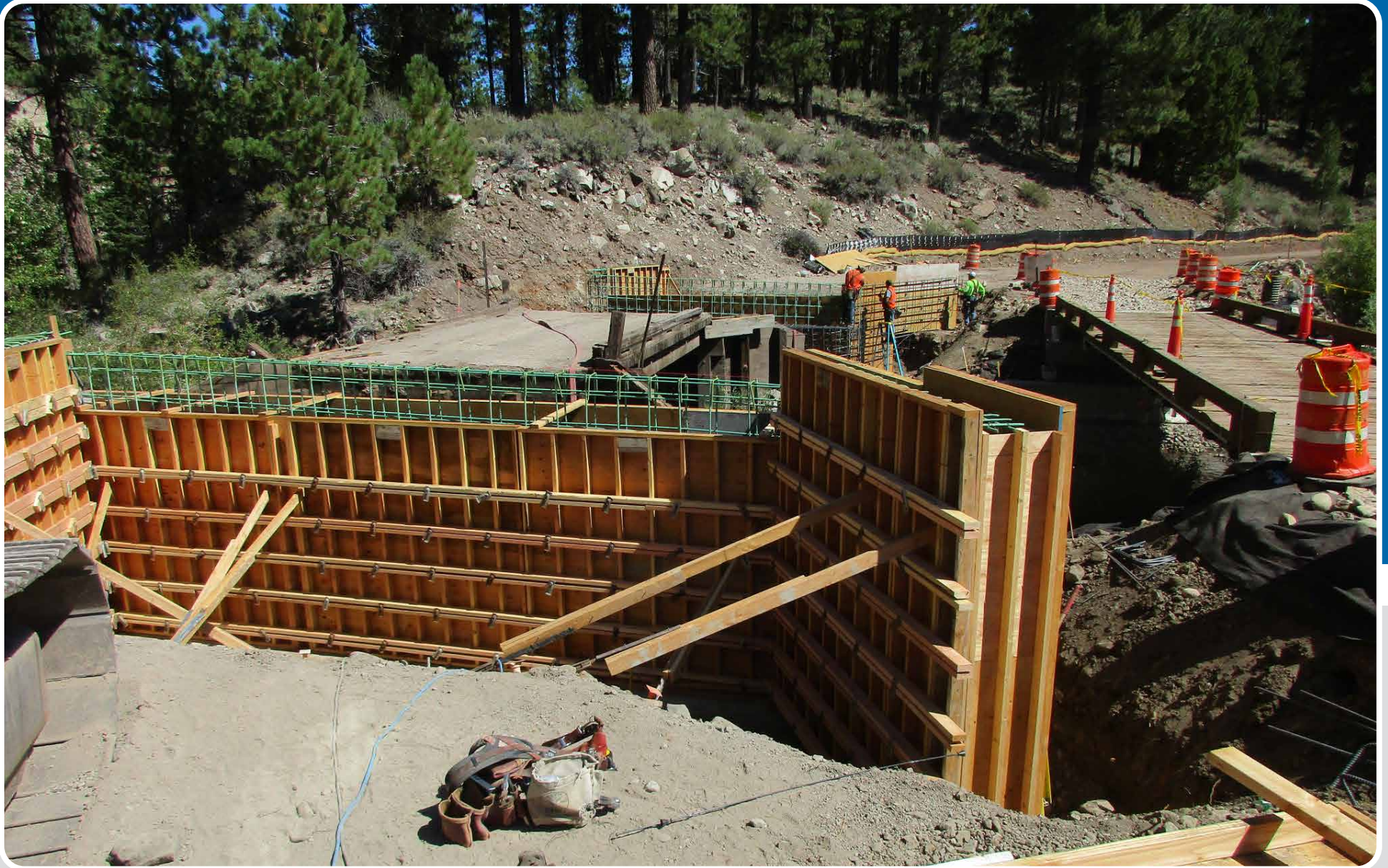
Abutments Under Construction DIXON MINE ROAD BRIDGE OVER WOLF CREEK, ALPINE COUNTY, CA