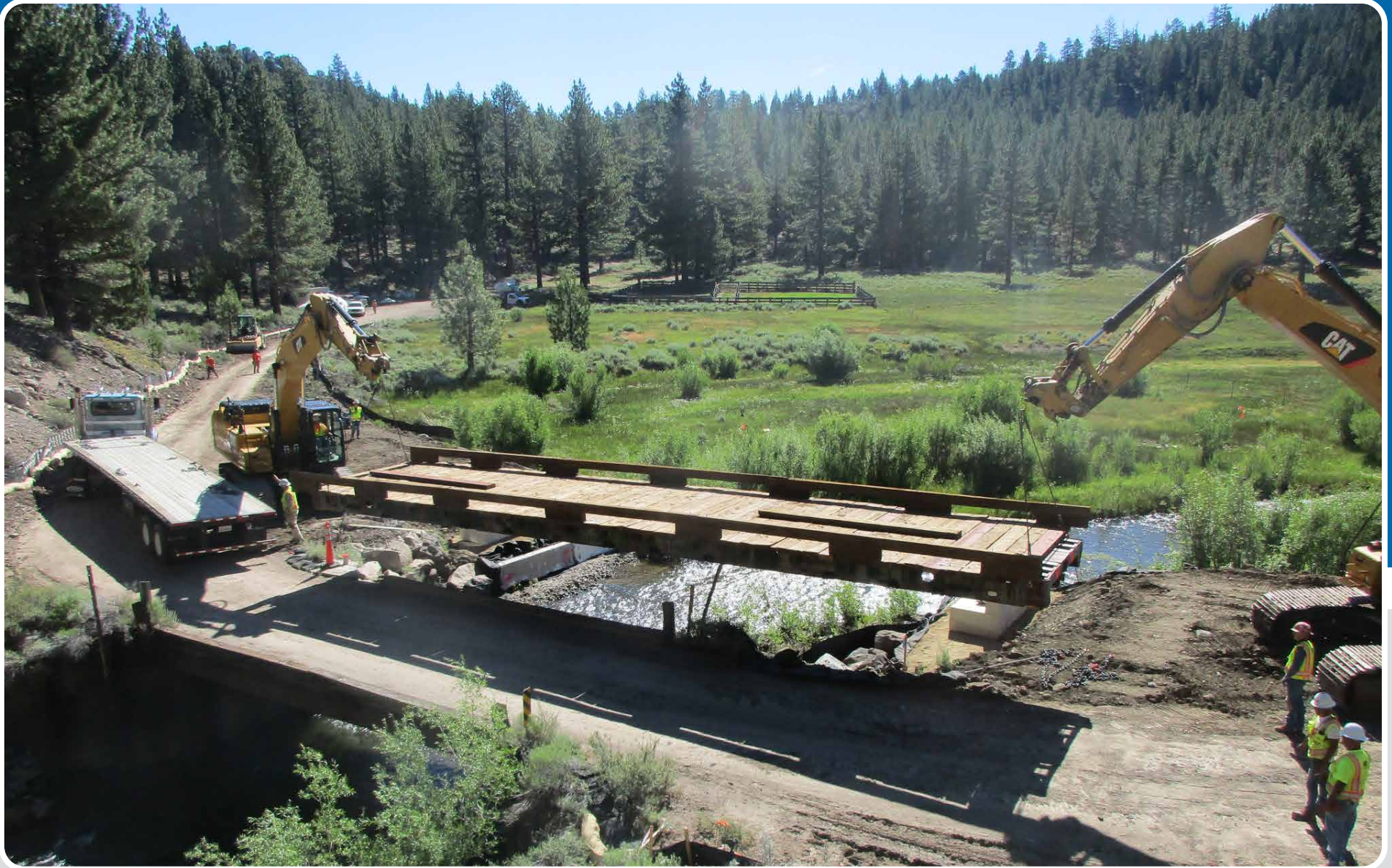
Installing Temporary Bridge DIXON MINE ROAD BRIDGE OVER WOLF CREEK, ALPINE COUNTY, CA