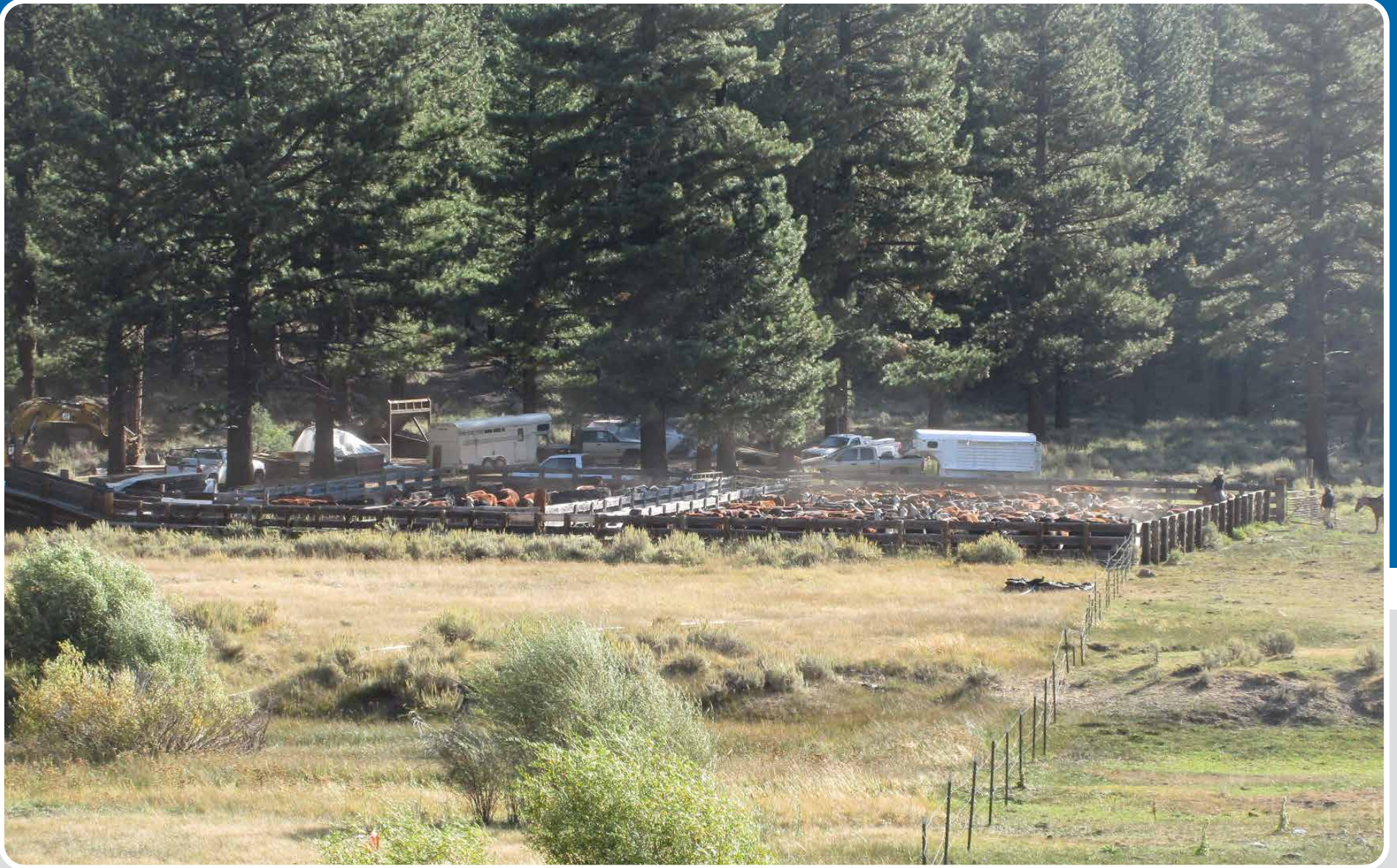
Cattle Drive Next to the Site DIXON MINE ROAD BRIDGE OVER WOLF CREEK, ALPINE COUNTY, CA