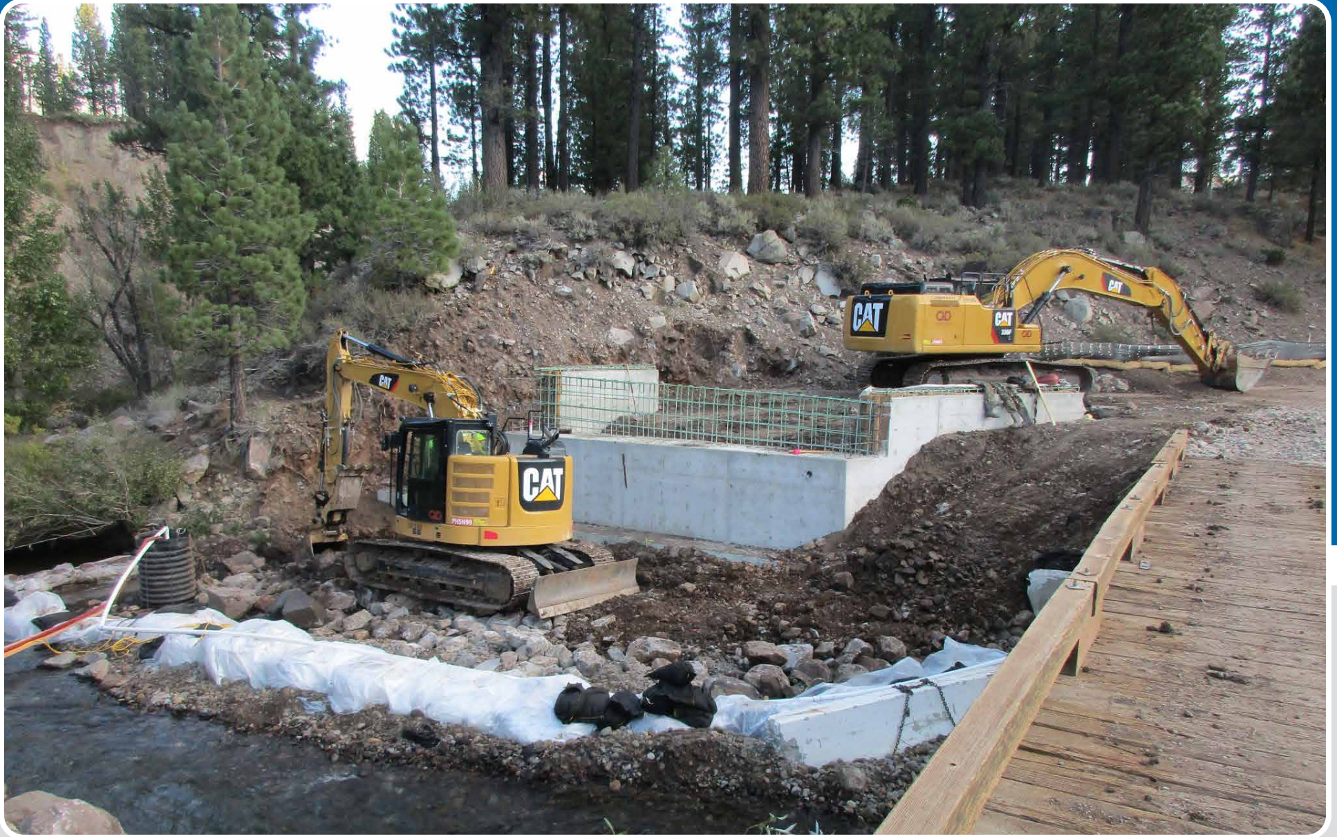
In-Water Work Placing RSP (Rock Slope Protection) DIXON MINE ROAD BRIDGE OVER WOLF CREEK, ALPINE COUNTY, CA