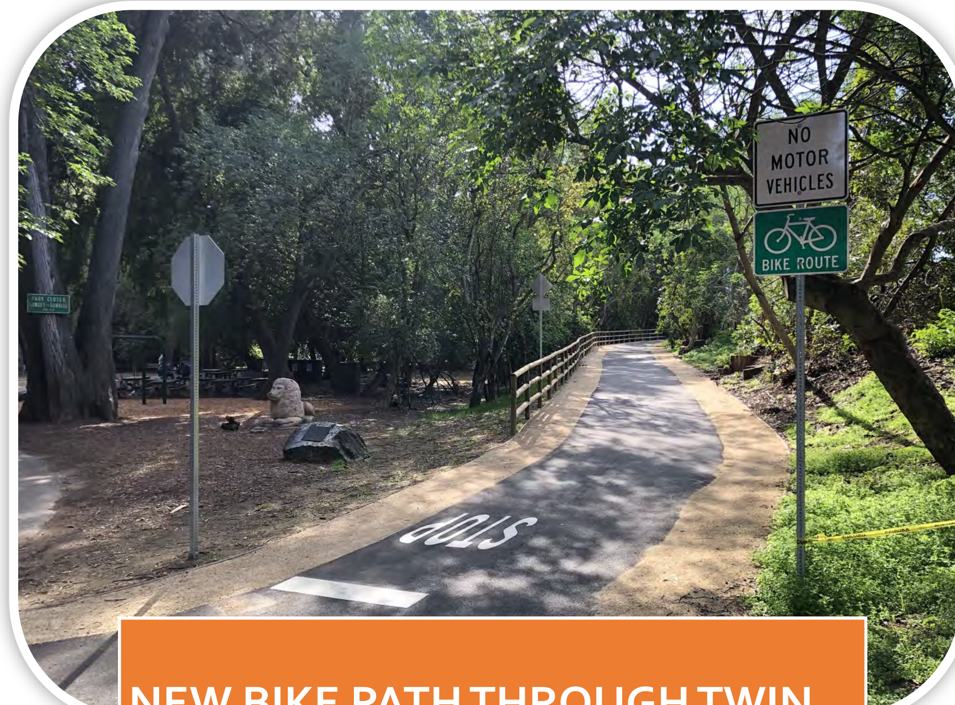
NEW BIKE PATH THROUGH TWIN PINES PARK