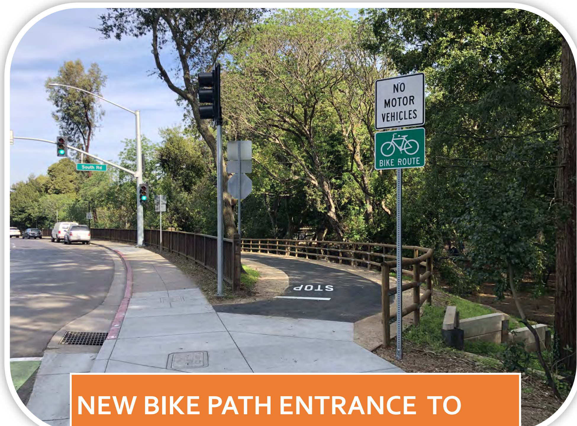
NEW BIKE PATH ENTRANCE TO TWIN PINES PARK FROM RALSTON AVENUE AND SOUTH ROAD