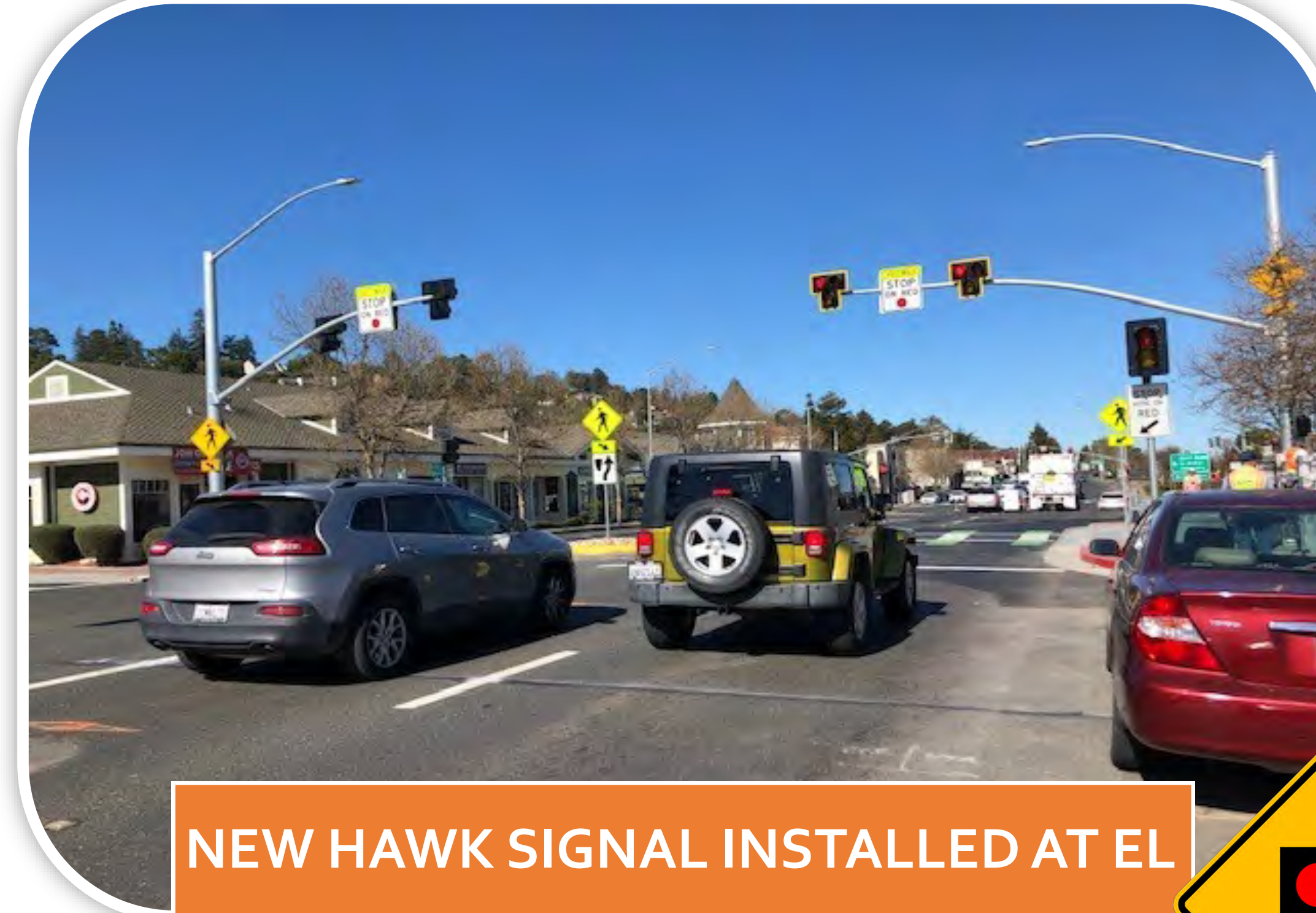
NEW HAWK SIGNAL INSTALLED AT EL CAMINO REAL AND EMMETT AVENUE