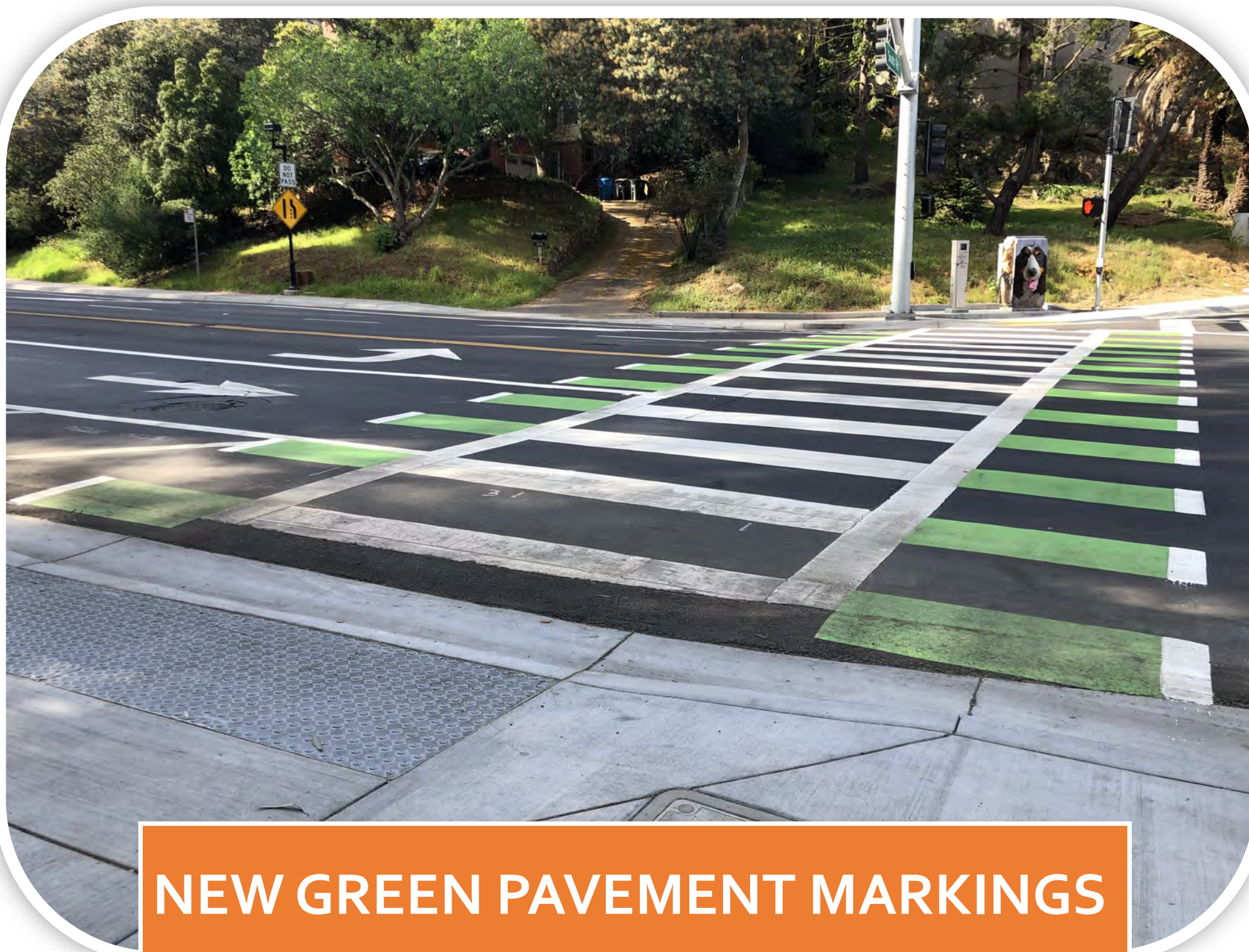
NEW GREEN PAVEMENT MARKINGS AND ADA RAMPS INSTALLED THROUGHOUT THE CORRIDOR