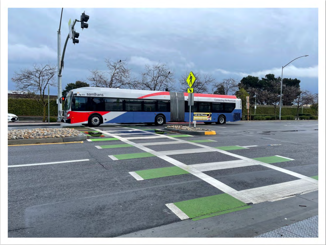
High Visibility Crosswalk on El Camino Real and Emmett Ave