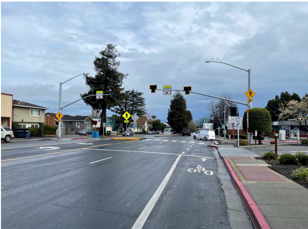
New Pedestrian Hybrid Beacon at Ralston Avenue and Elmer Street