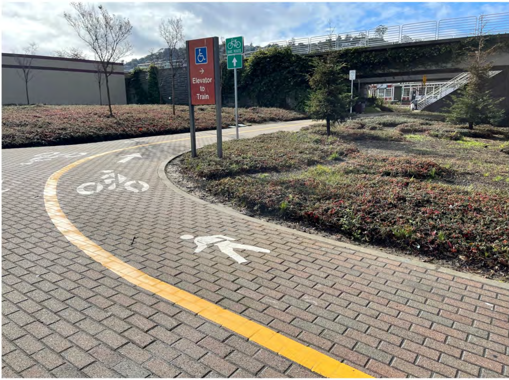
Shared path at the Caltrain Station