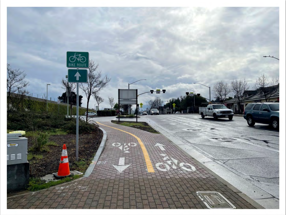
Shared path along El Camino Real