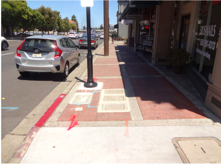
Before: Sidewalk along Ralston Avenue between 6th and El Camino Real