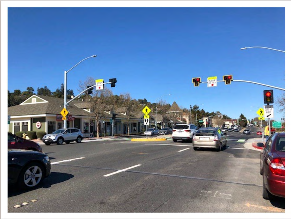
New Pedestrian Hybrid Beacon at El Camino Real and Emmett Ave