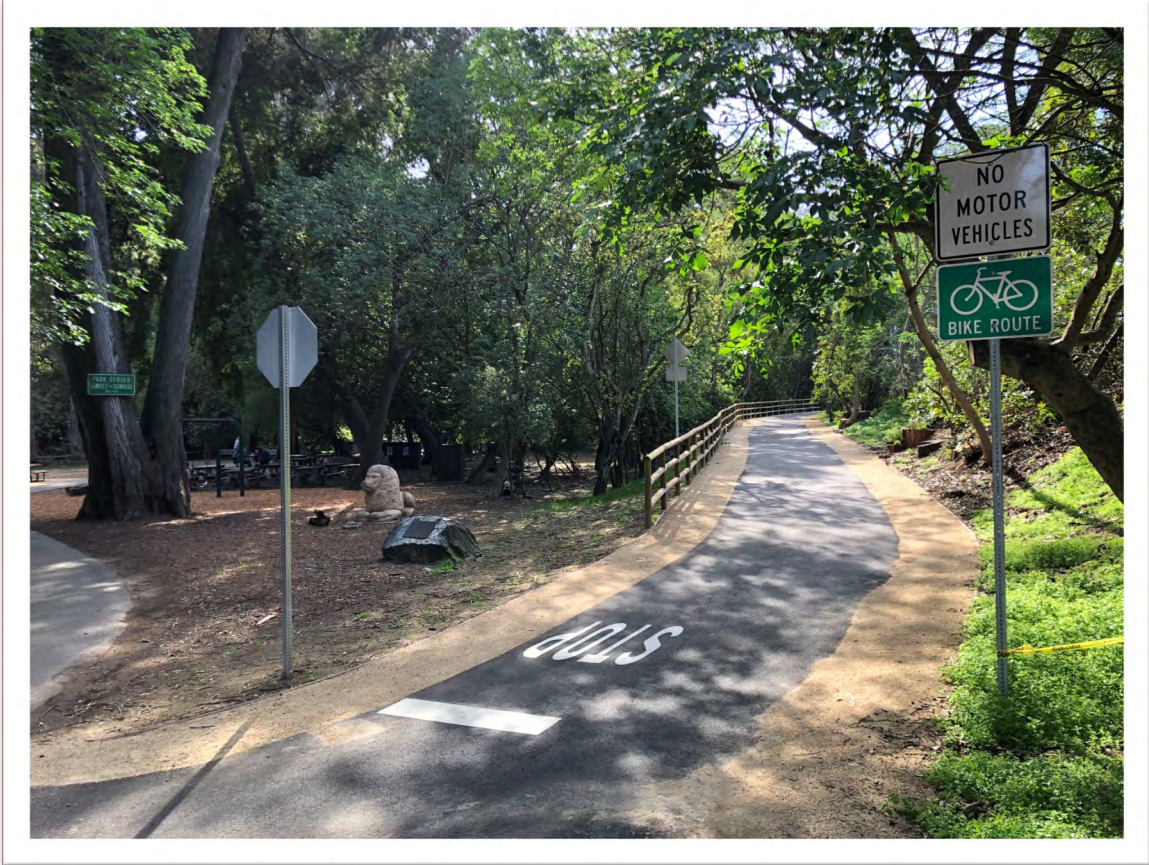
New bike path through Twin Pines Park