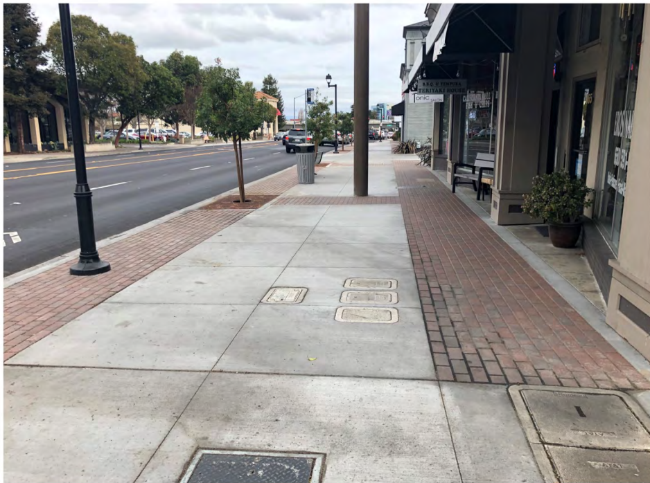
After : Sidewalk along Ralston Avenue between 6th and El Camino Real. The sidewalk was widened which allowed for addition street furniture and street trees.