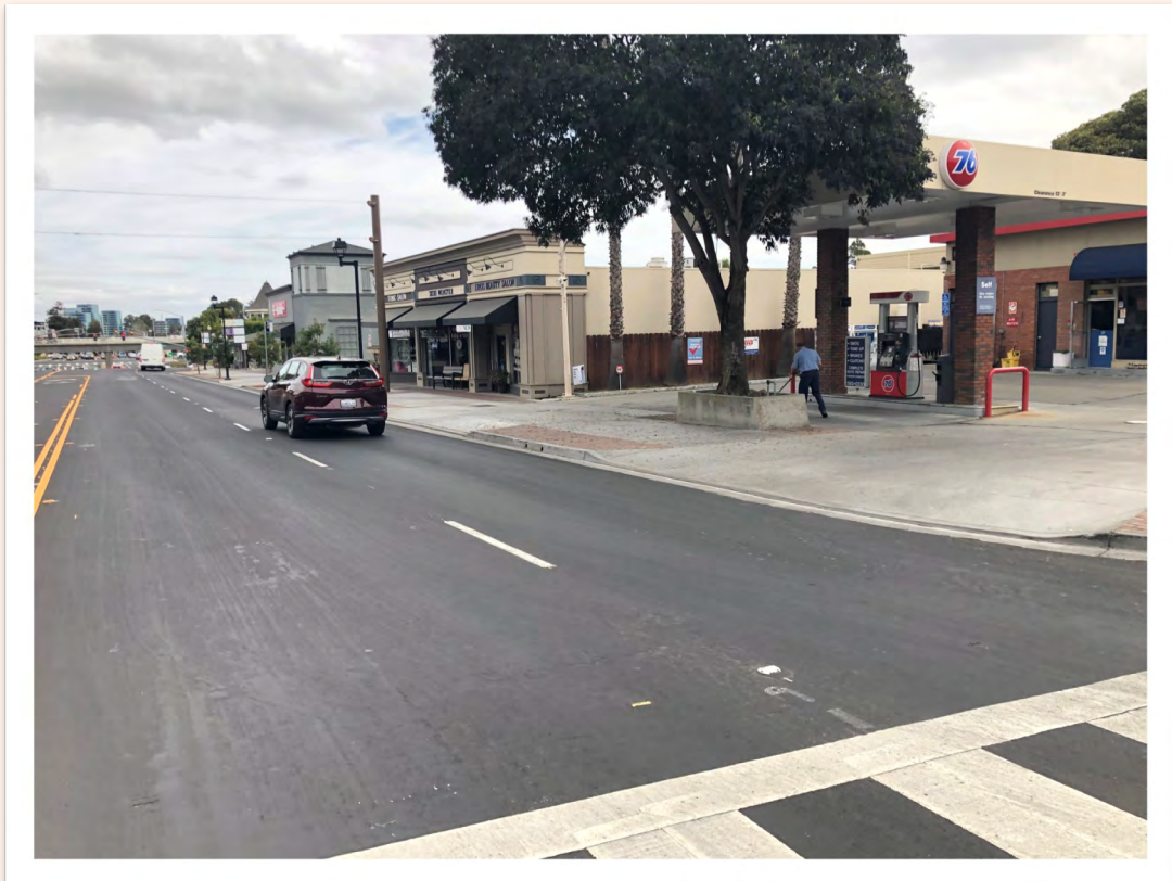
After: Ralston Avenue and 6th Avenue. Parking was removed from this section and the sidewalk was widened. You can also see the high visibility crosswalk.