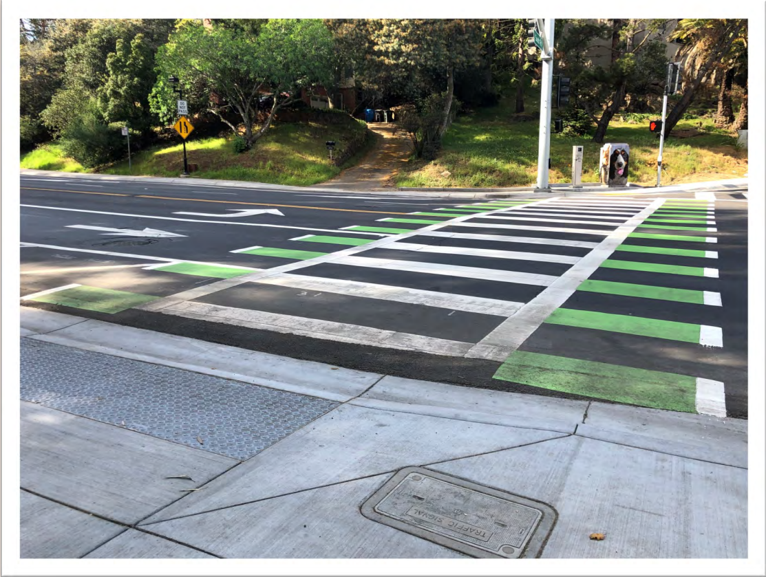
Typical new ADA ramps with high visibility crosswalks