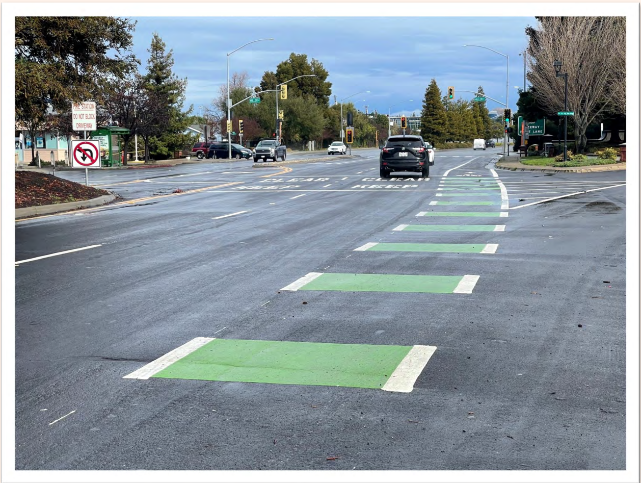
New bike lane along Ralston Avenue