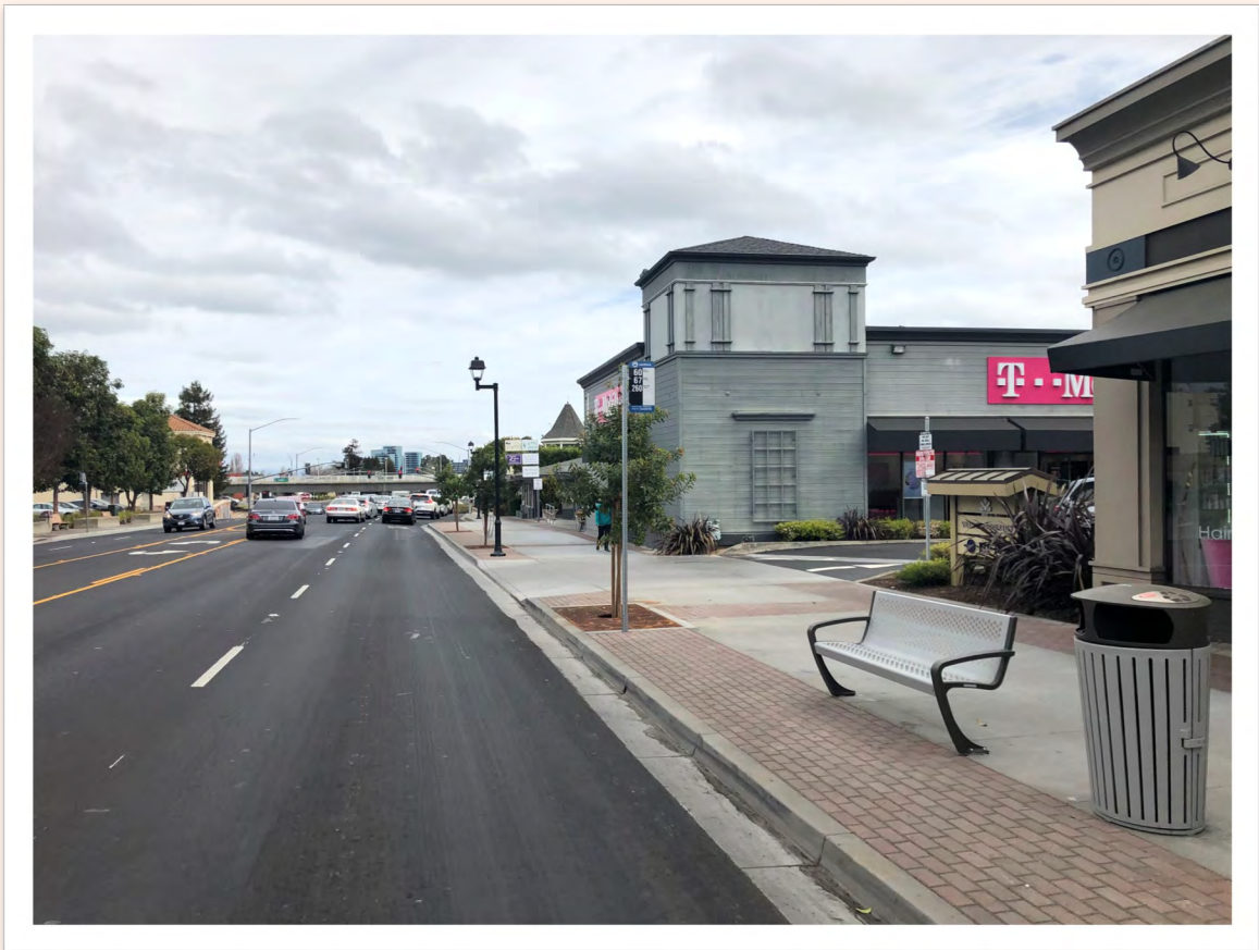
After: Ralston Avenue. Another look at the added sidewalk space and street furniture.