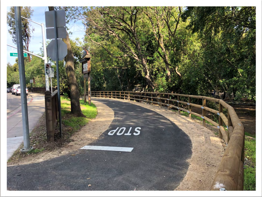
New bike path through Twin Pines Park