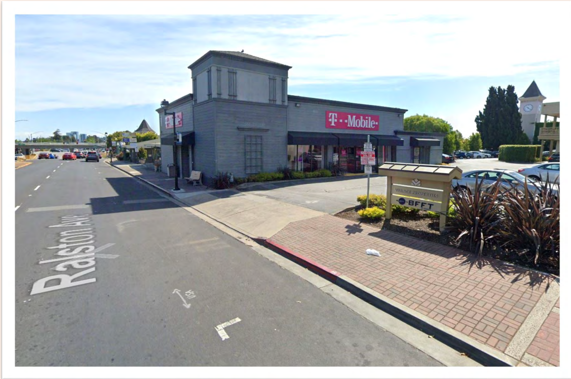
Before: Ralston Avenue