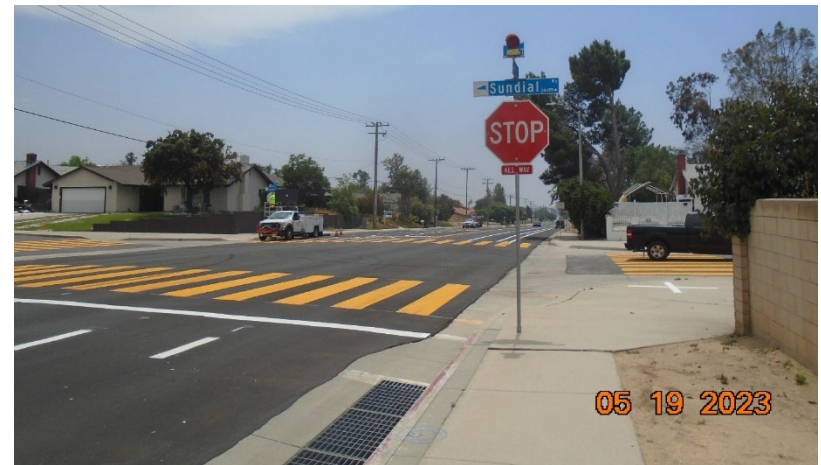
Indian St at Sundial Wy – After (Stop Signs and additional Safety Crosswalks added)