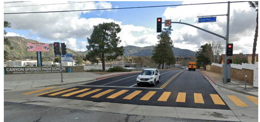
Cougar Canyon Rd – After (Stop Bar set back with enhanced Safety Crosswalk)