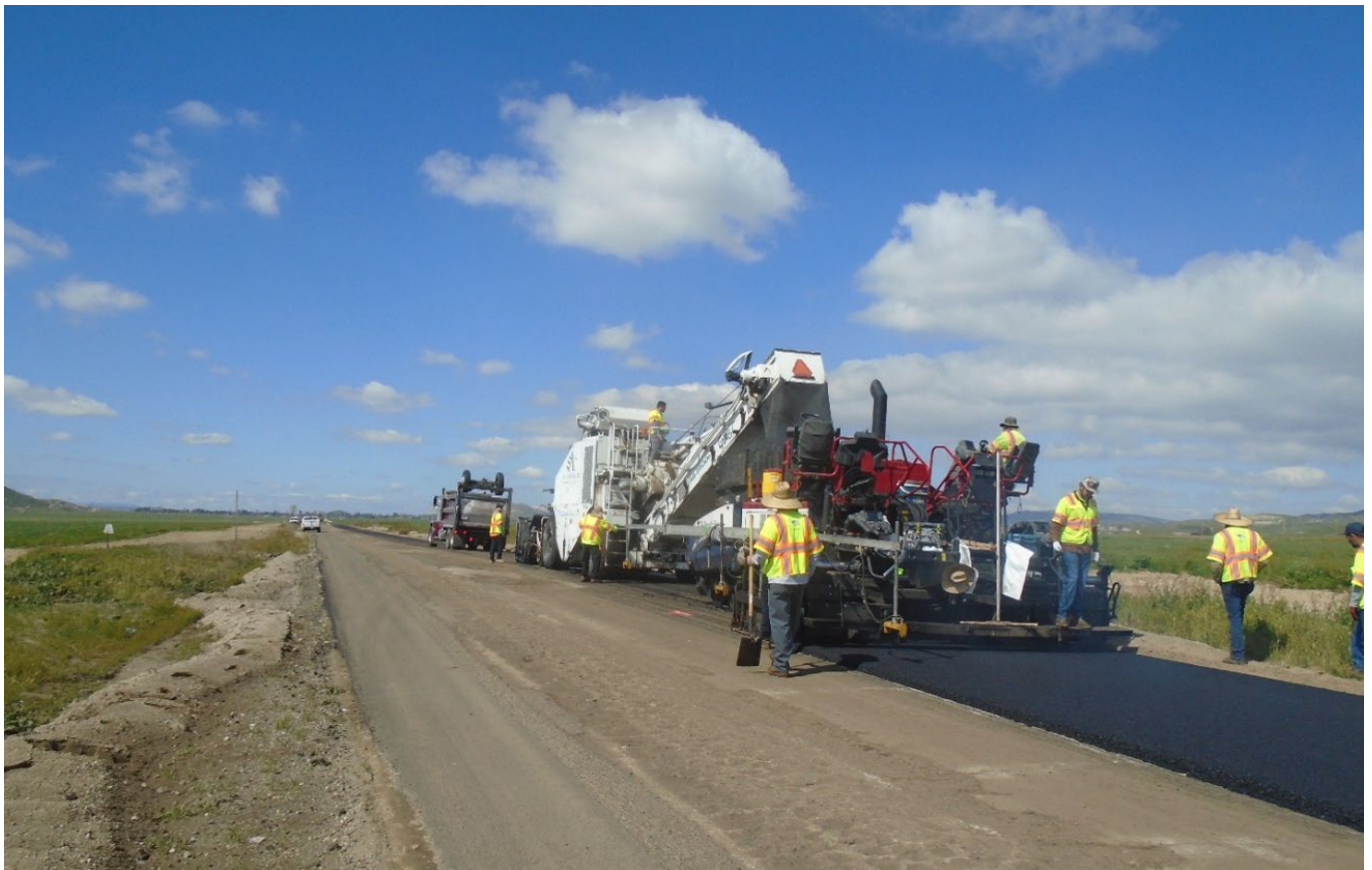
Before and After side-by-side comparisons