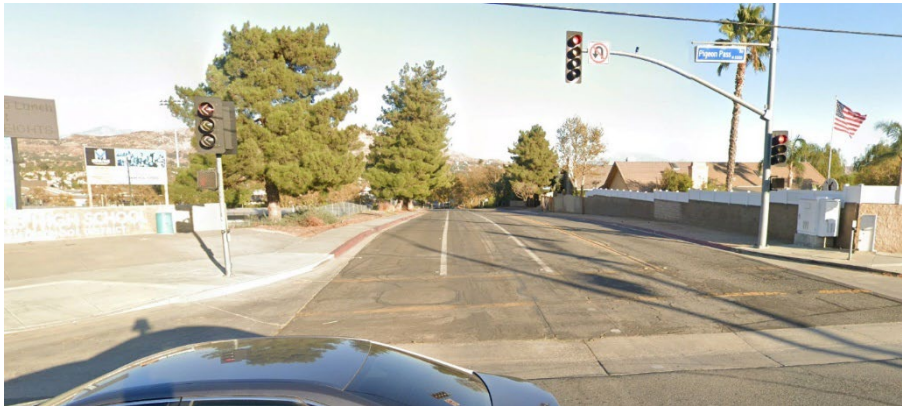
Cougar Canyon Rd – Before