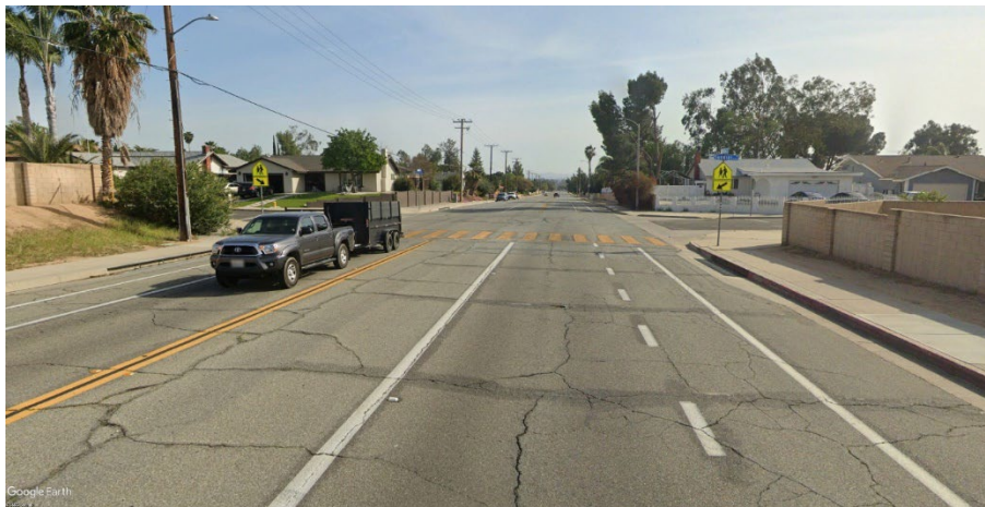
Indian St at Sundial Wy – Before