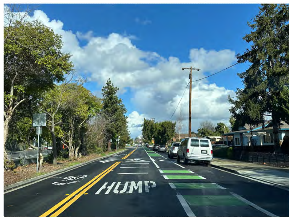
Leong Drive (between Alamo Court and Leong Drive) - Speed hump, Class II bike lane on northbound, & sharrows on southbound.