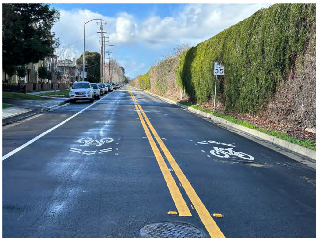
Fairchild Drive (between Leong Drive and Whisman Road) - Sharrows on both directions.