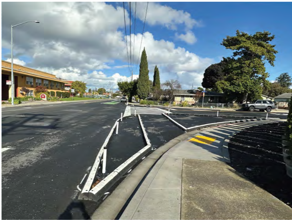
Leong Drive/ Winston Place intersection - Rubberized curb bulb-outs & high visibility crosswalks.