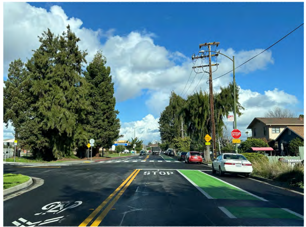
Leong Drive (at Moffett Blvd) - Class II bike lane on northbound, sharrows on southbound, & high visibility crosswalks.