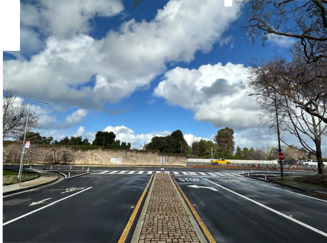
Fairchild Drive and Whisman Road - rubberized curb bulb-outs and high visibility crosswalks.