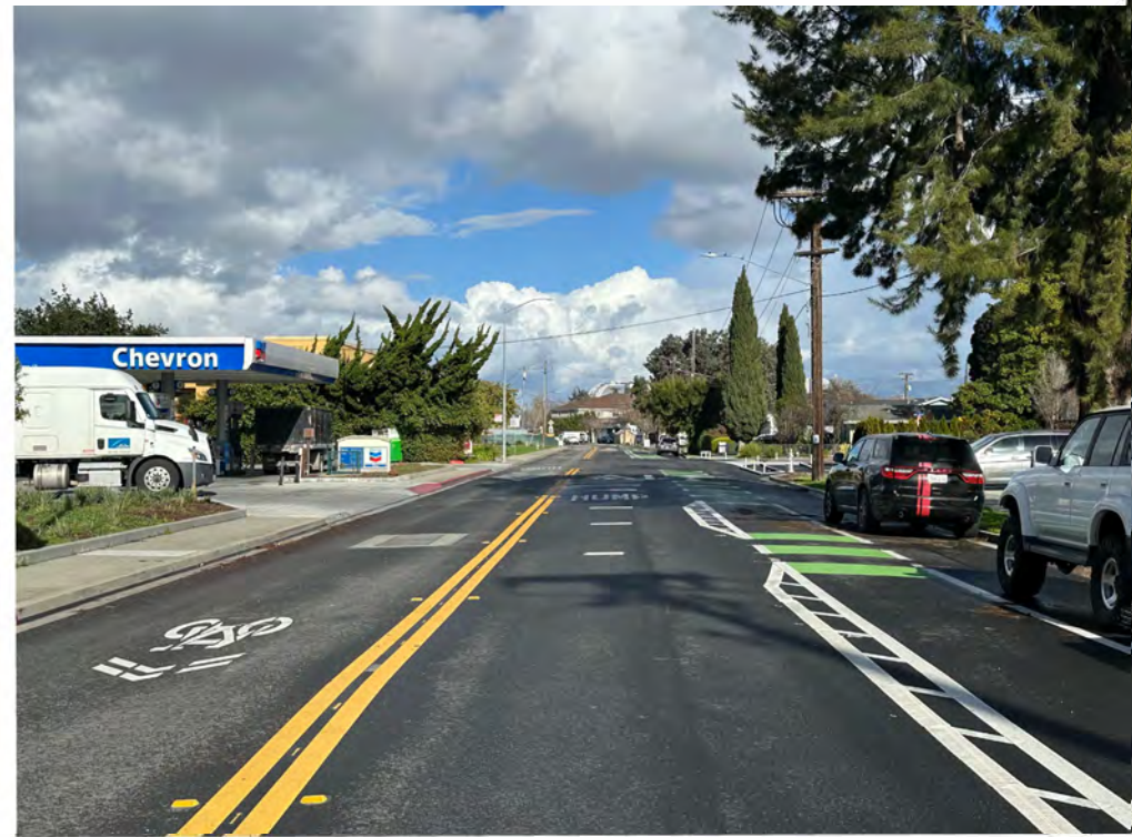
Leong Drive (near Winston Place) - Speed hump, Class II bike lane with buffer on northbound & sharrows on southbound.