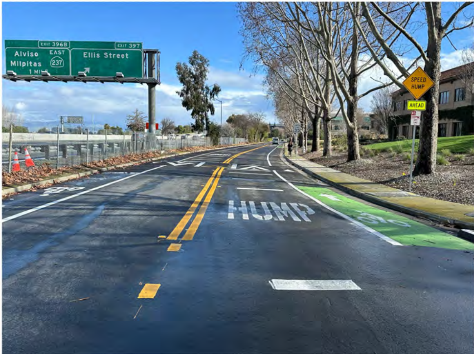
Fairchild Drive (between Whisman Road and National Ave) - Speed hump, Class II bike lanes on both directions, & double yellow center striping.